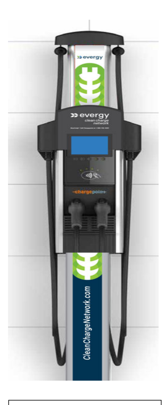
EXHIBIT C Approved Signage to be deployed at the time of installation