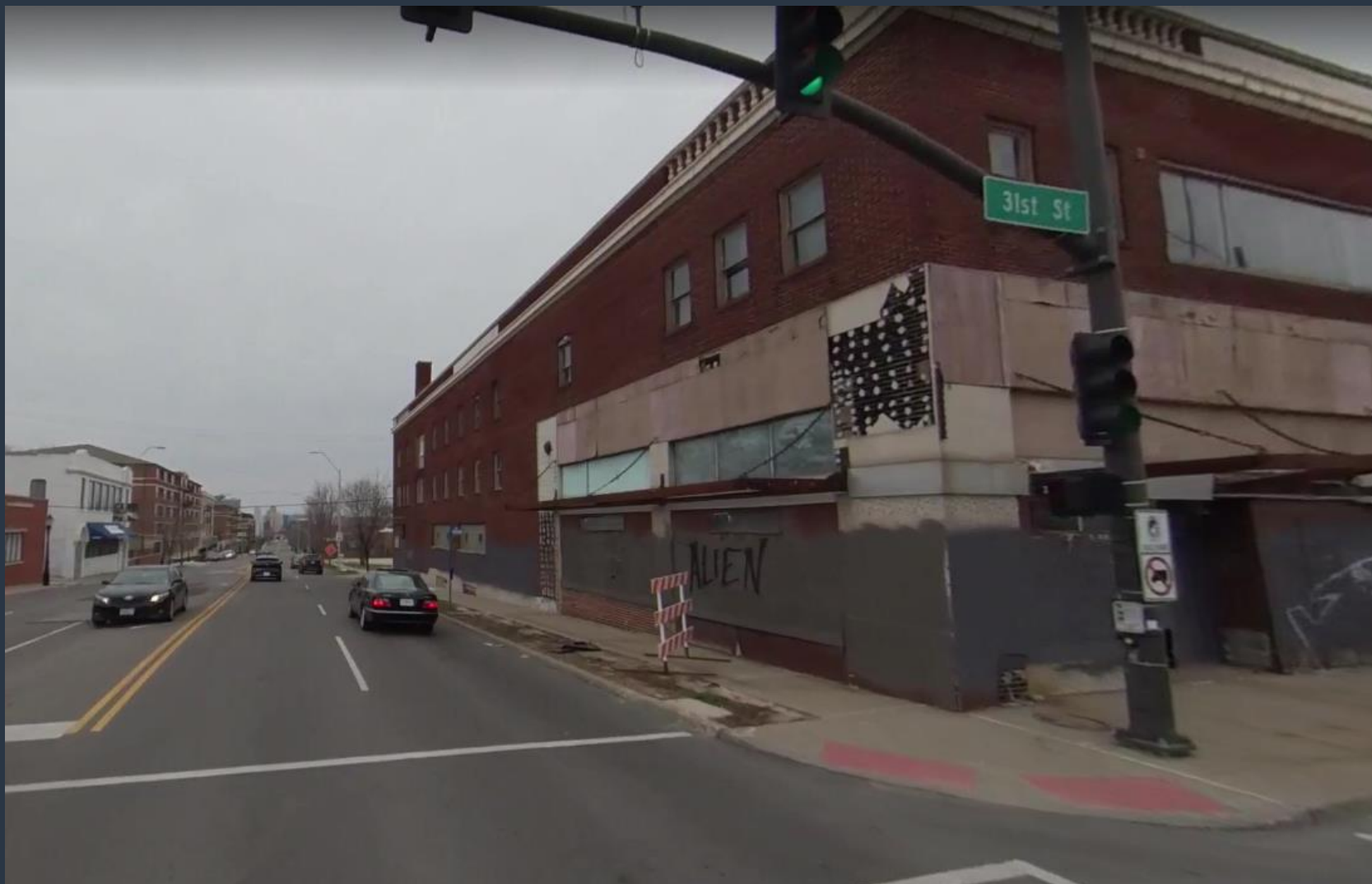
View looking north on Gillham Rd at 31 st St