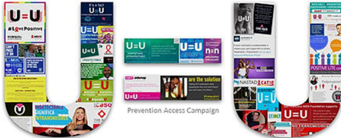
Prevention Access Campaign