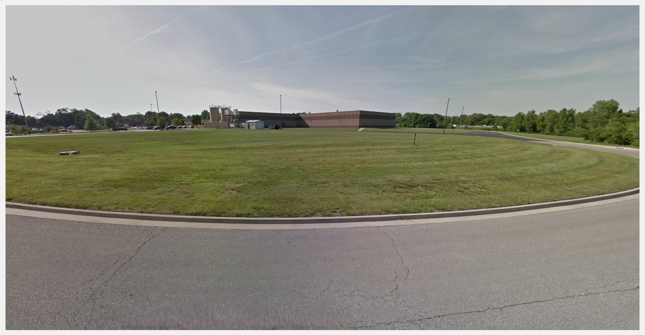
View northwest towards site from private drive