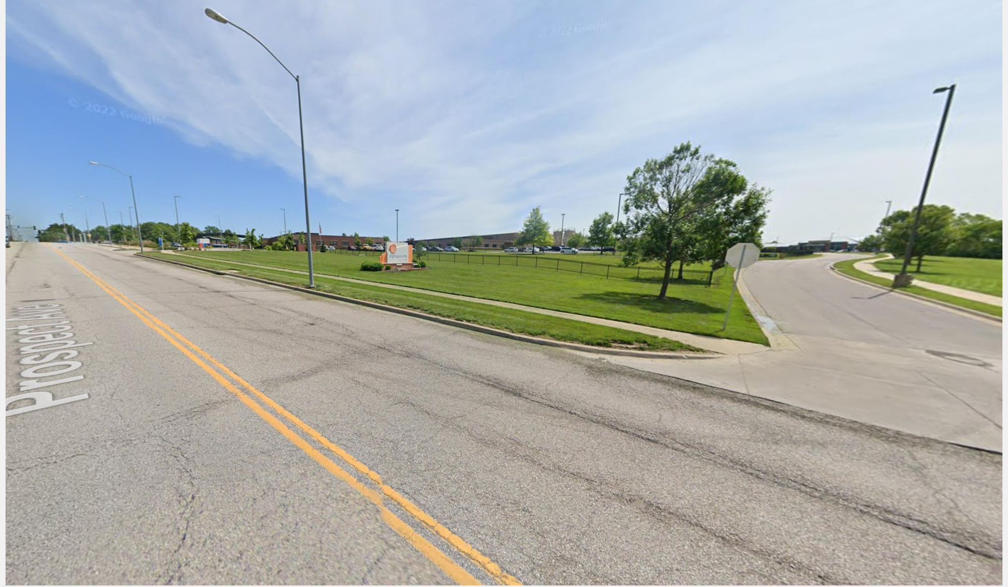
View northeast towards site from Prospect Ave