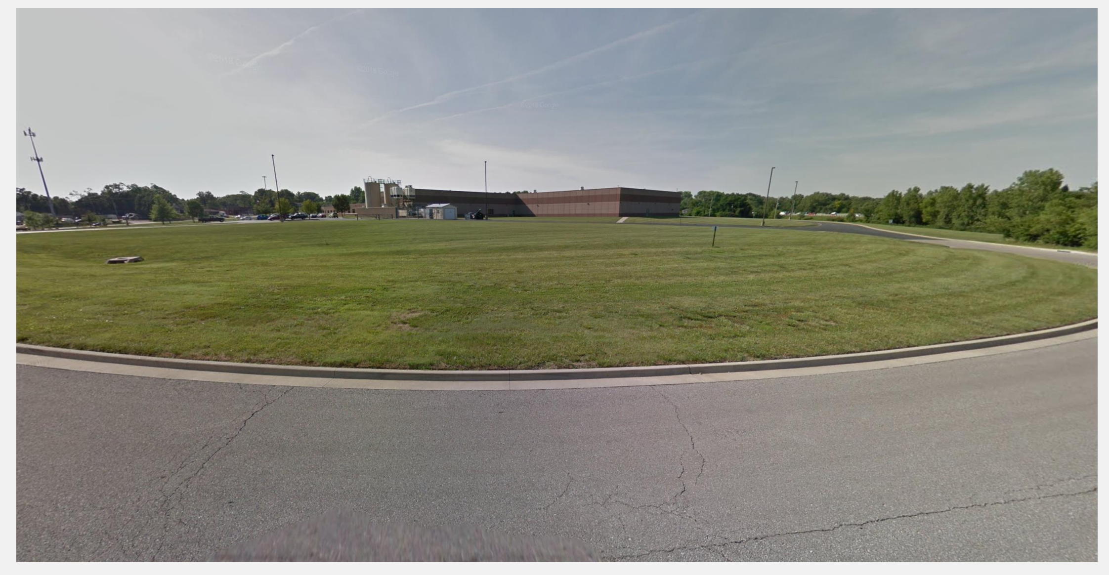
View northwest towards site from private drive