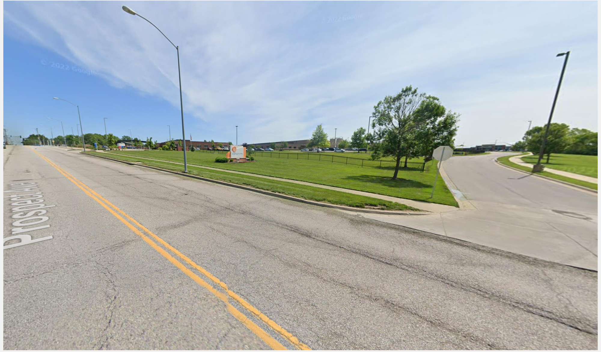
View northeast towards site from Prospect Ave