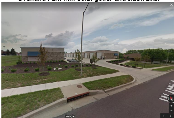
Street view of applicant's storage facility in Overland Park with curb, gutter and sidewalks.

The applicant has objected to the requirement of half-street improvements including the installation of curbs, gutters and sidewalks. The applicant has suggested that their opposition is due financial costs associated with the improvements as well as security concerns resulting from said improvements. Staff can find no reason for there to be a security concern resulting from public improvements. Generally such concerns are addressed with site and building including such elements as fencing. However, the applicant is unwilling to construct a fence or gate. The applicant has constructed similar self-storage facilities in Overland Park, Olathe and Lenexa, and all public improvements were either already existing or were completed by the applicant. The public improvements required by city code are standard and apply to all development and are consistent with those of adjacent communities.