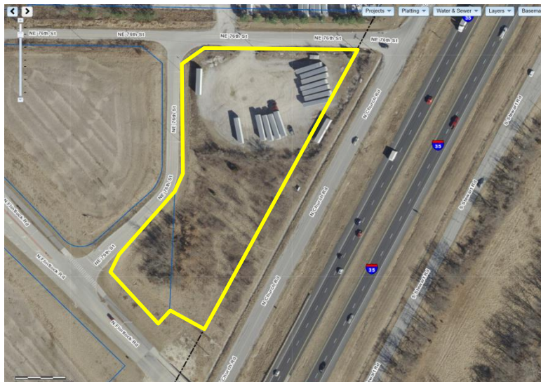
Site shown bordered in yellow below

The 3.4 acre site is bordered by NE 76 th Street on the north and west, N. Church Road on the east, and N. Flintlock Road on the south. The site is comprised of two parcels. There are no permanent structures currently existing on the site. However, it is being used for auto storage on the northern half of the site. The rest of the property is undeveloped and the majority of the property east of Locust is surface parking. The majority of the surrounding land uses are industrial (to the north) and undeveloped (to the west and south). There is an existing curb, gutter and sidewalk to the south of the site along N. Flintlock Road. NE 76 th Street is unimproved and only has streetlighting. The site is generally flat and access to the site is from the north off of NE 76 th Street.