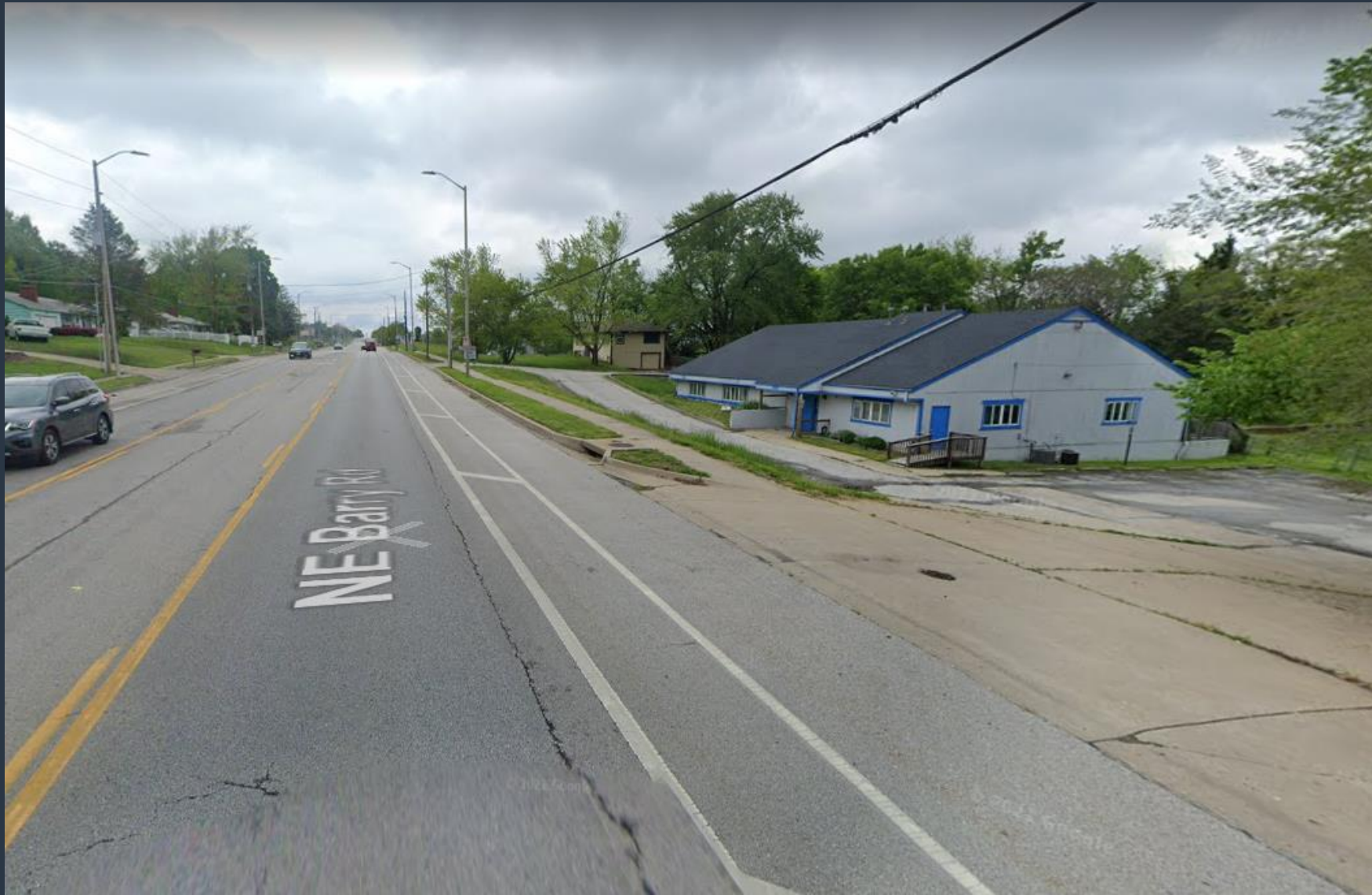
View looking west on NE Barry Rd