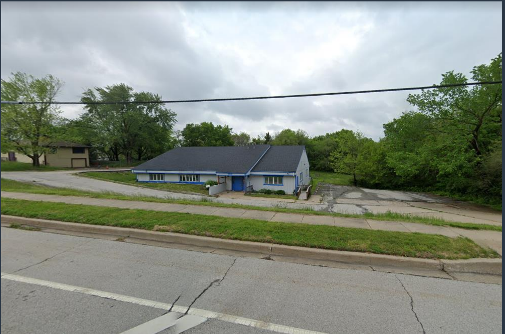
View from NE Barry Rd