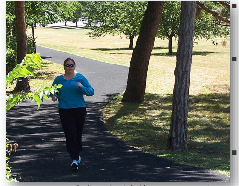
Design and stakeholder engagement underway for Mill Creek Park Green Infrastructure project Image from kcparks.org