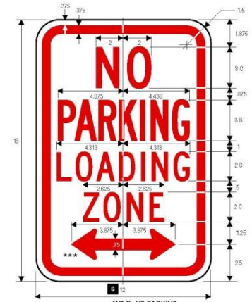
R7-6 NO PARKING

LEGEND — GREEN (RETROREFL) BACKGROUND — WHITE (RETROREFL)