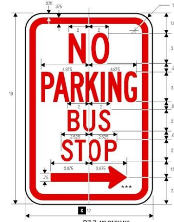
R7-7 NO PARKING

LEGEND — RED (RETROREFL) BACKGROUND — WHITE (RETROREFL)