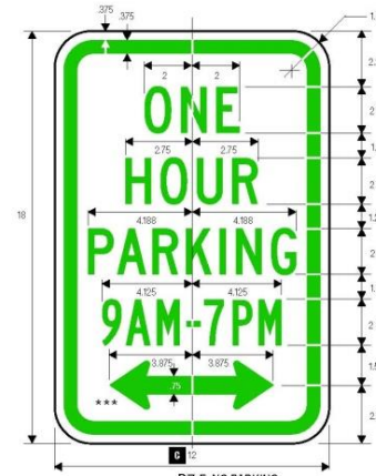
R7-5 NO PARKING

LEGEND — GREEN (RETROREFL) BACKGROUND — WHITE (RETROREFL)