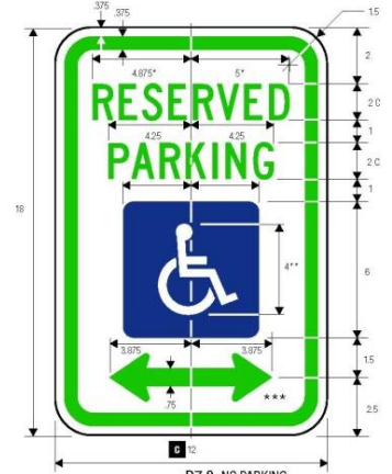
R7-8 NO PARKING

LEGEND — RED (RETROREFL) BACKGROUND — WHITE (RETROREFL)