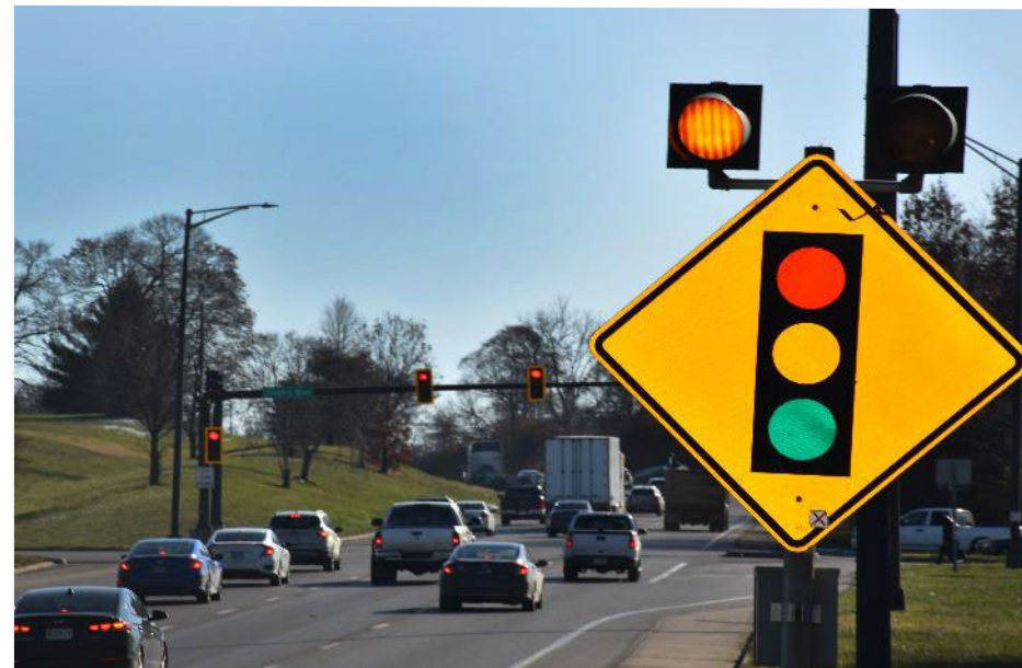
3. Feasibility & Appropriateness of Potential Approaches