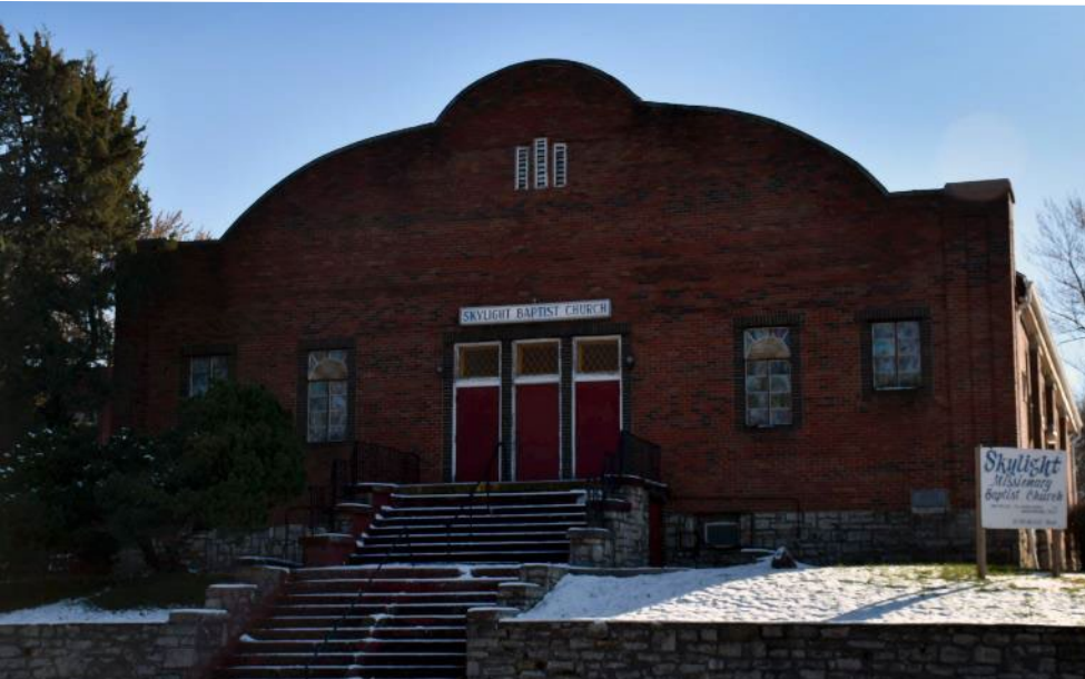
2. Focus on the Community