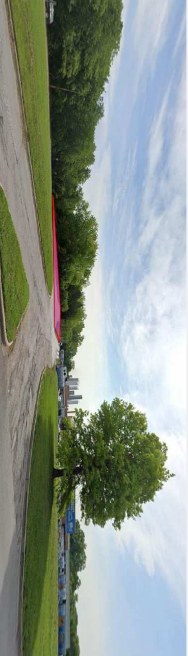
View looking east from Emanuel Cleaver II Boulevard