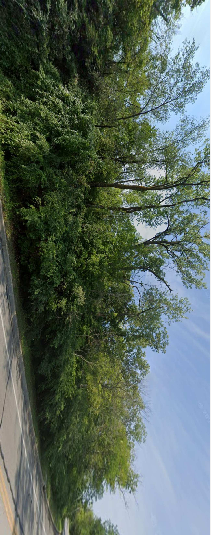
View looking south from Leeds Trafficway