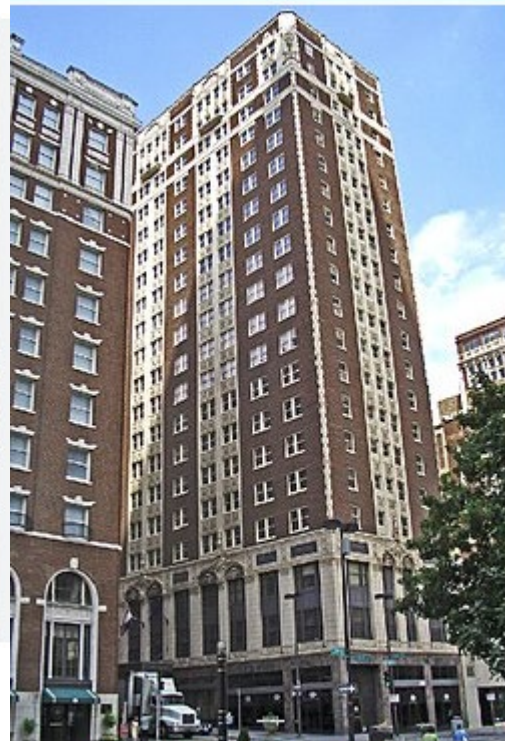
Hotel Phillips, Kansas City, Missouri