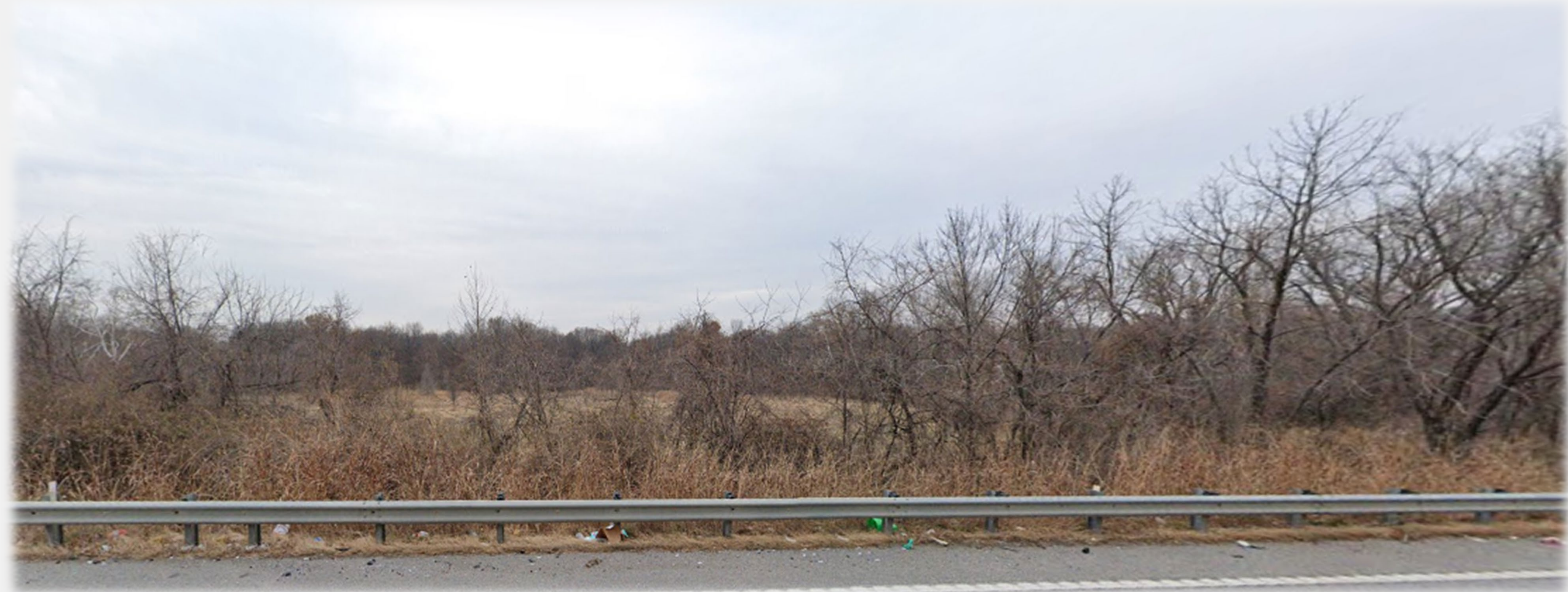
View looking west from Interstate 35