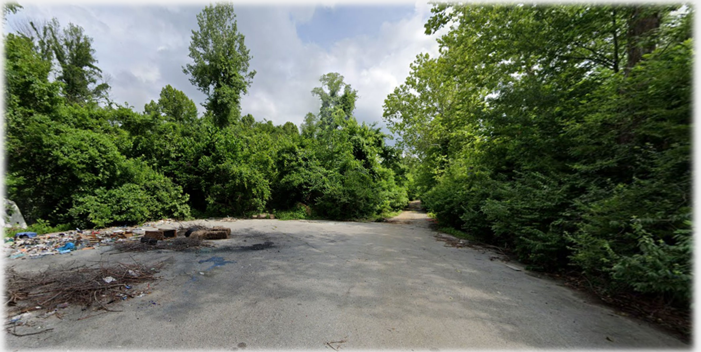
View looking north from NE Oak Ridge Road