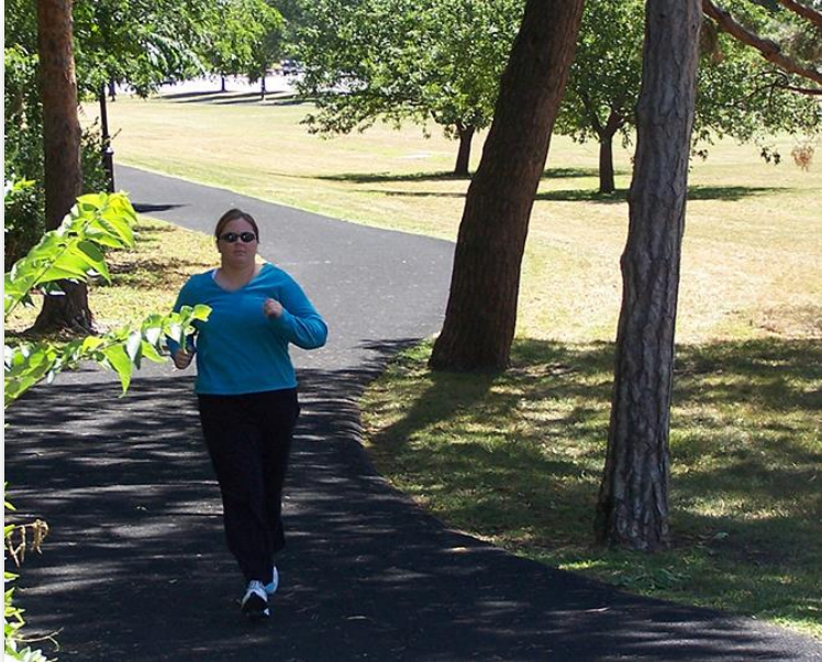
Design and stakeholder engagement underway for Mill Creek Park Green Infrastructure project