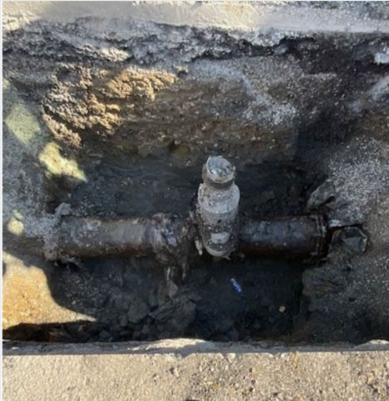
Old Water Valve