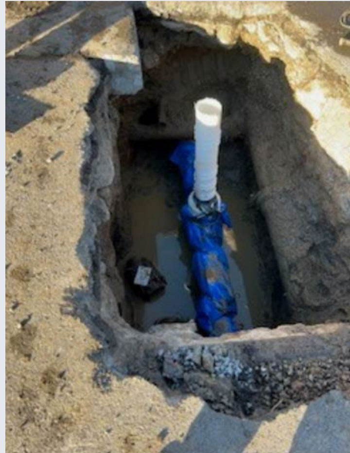
New Water Valve with Poly Wrap Installed