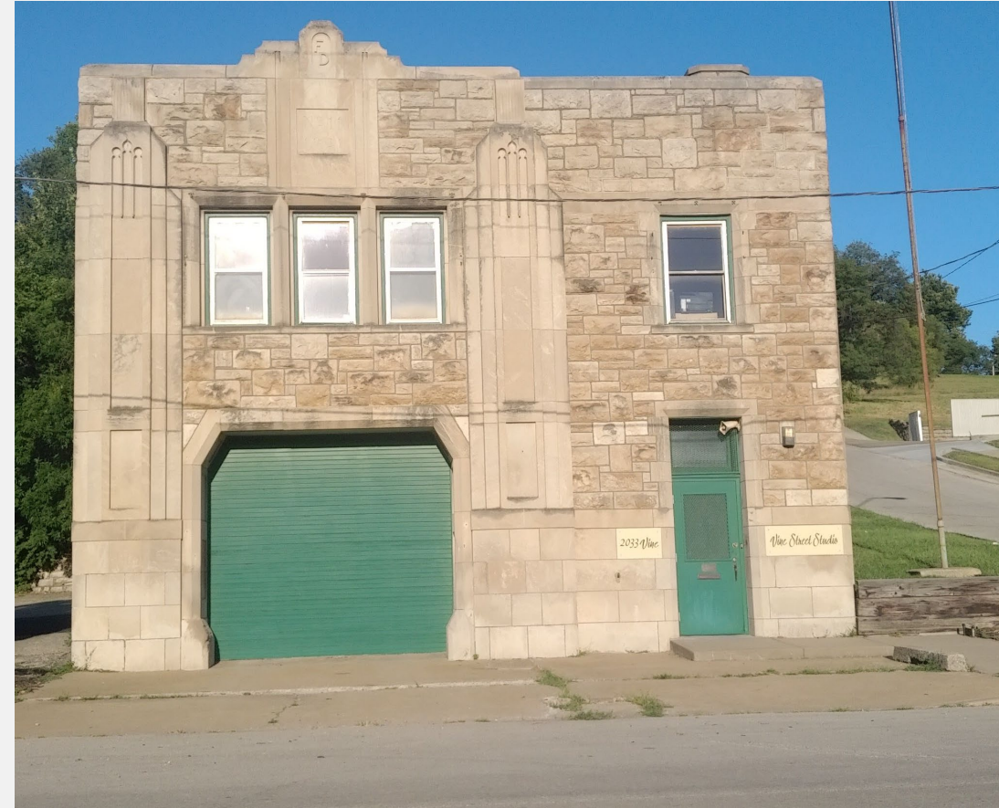
Fire Station No. 11 at 2033 Vine Street