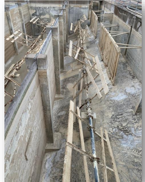
Water Treatment Plant Primary and Secondary Clarifiers and Secondary Basins