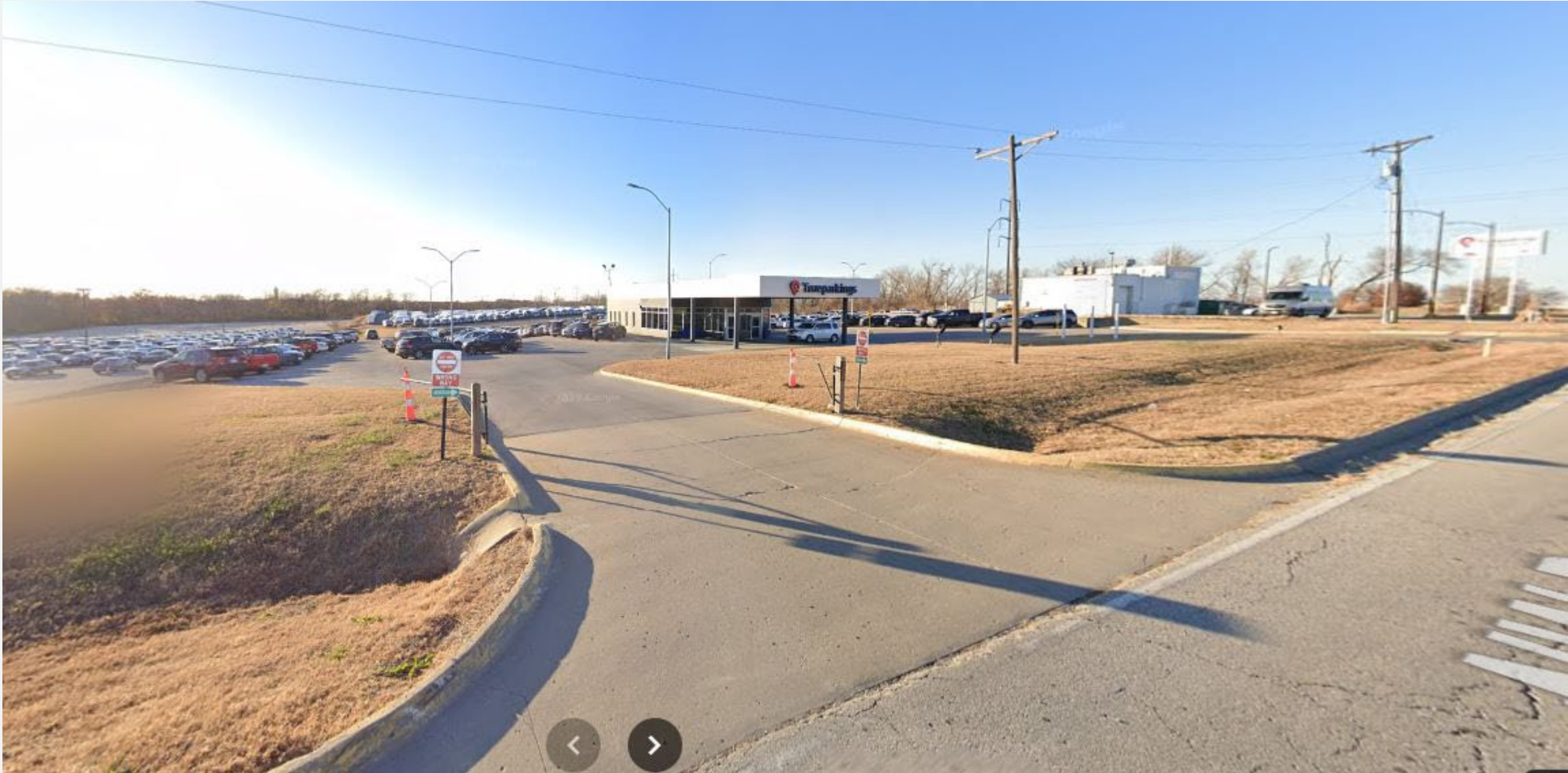
View from NW Prairie View Road