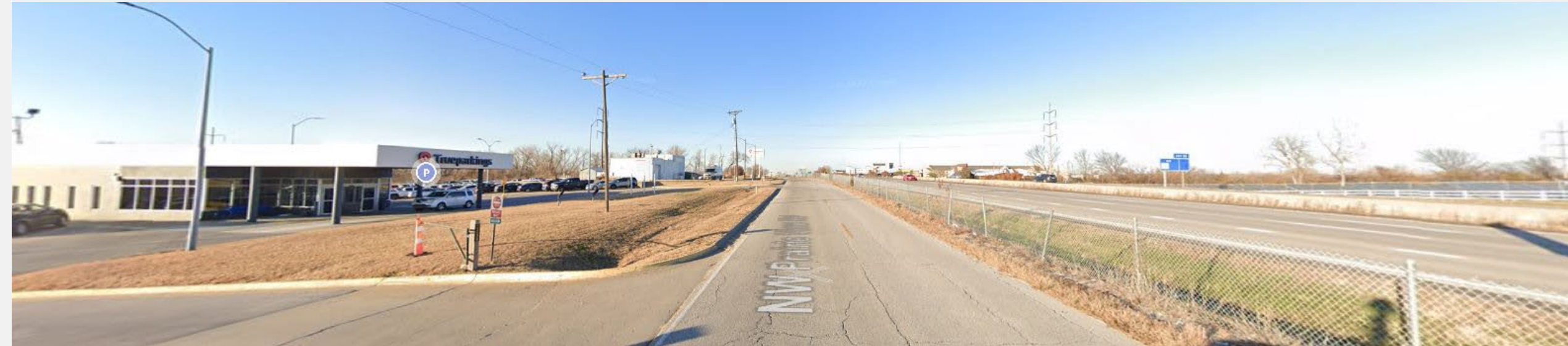
View north from NW Prairie View Road (site on the west of road)