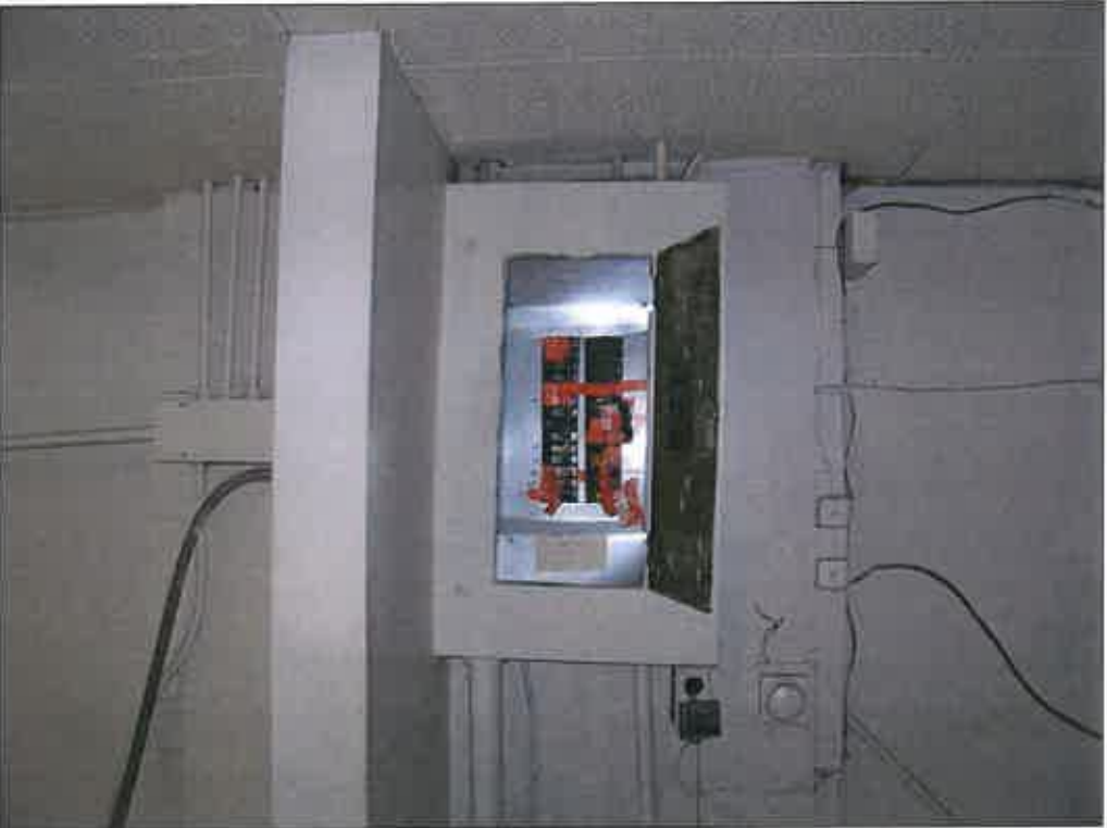
Interior – circuit breakers taped to prevent tripping