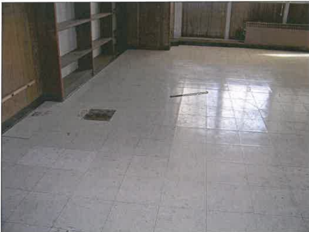
Interior – asbestos flooring and mastic