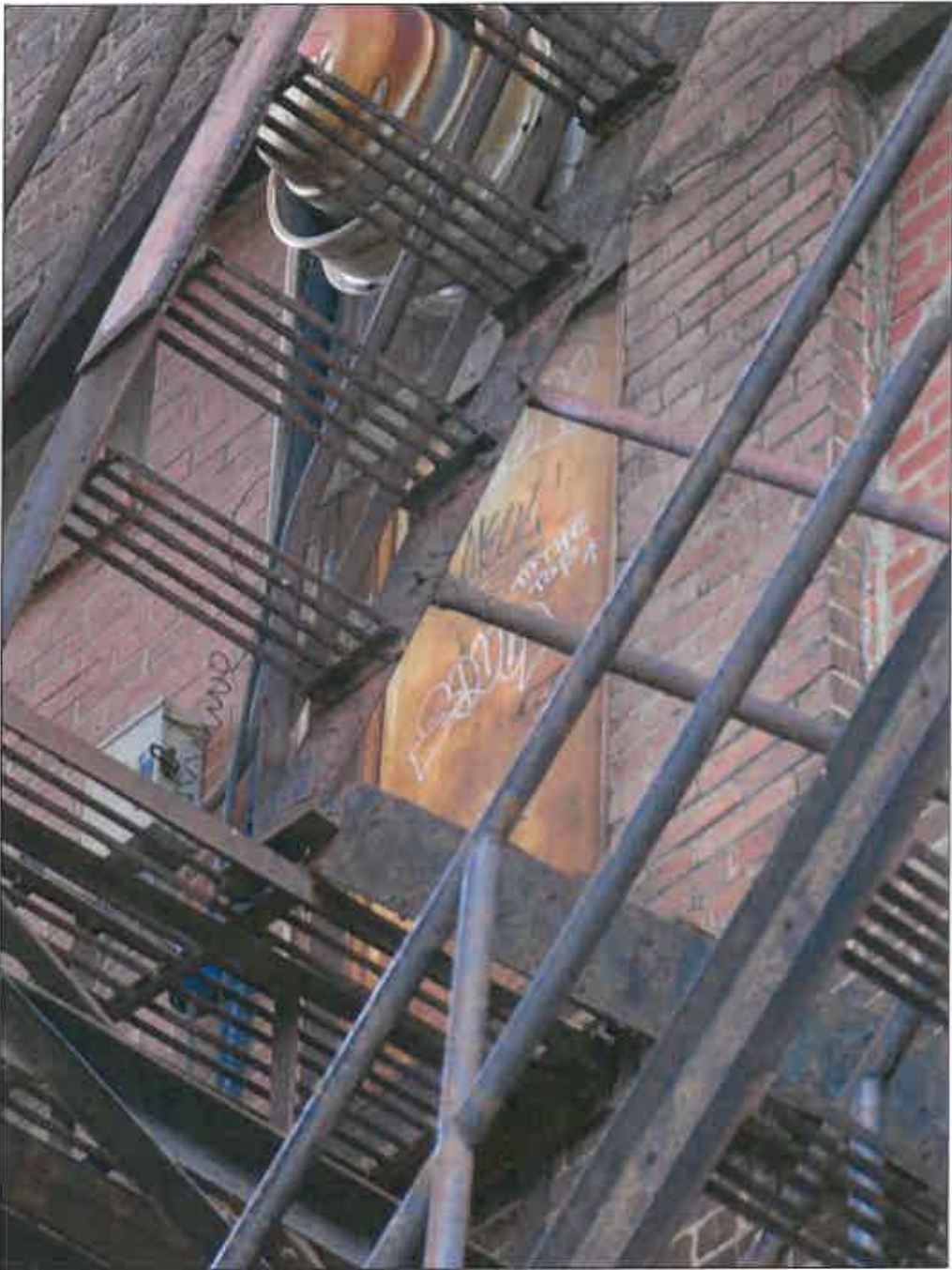
West side of Study Area – rusted fire exit doors; graffiti; steel fire stairs not to code, deteriorated