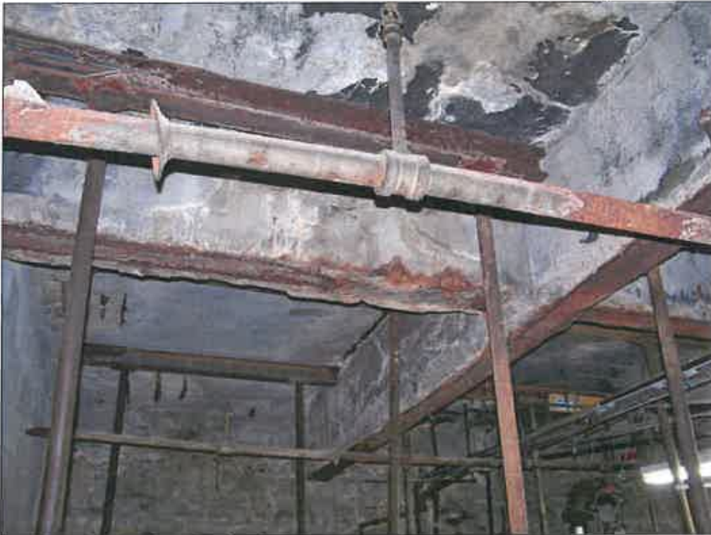
Interior – deterioration of steel and concrete structural components, supports