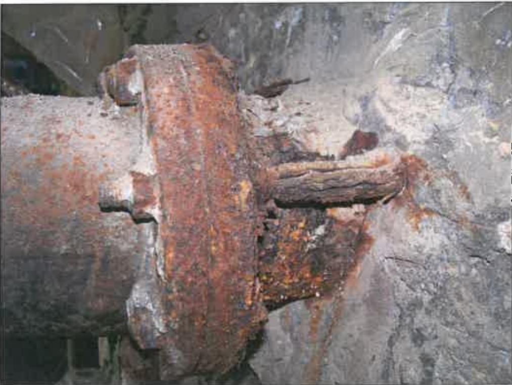
Interior – corrosion of water supply to fire suppression system