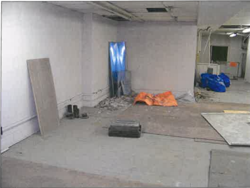
Interior – failure of finishes; debris

In addition to structural deterioration, a few blight conditions were observed within the Study Area related to the deterioration of the site and non-primary improvements. These conditions which negatively affect the appearance and utilization of the area include deterioration of the sidewalk along Grand Boulevard in front of the building.