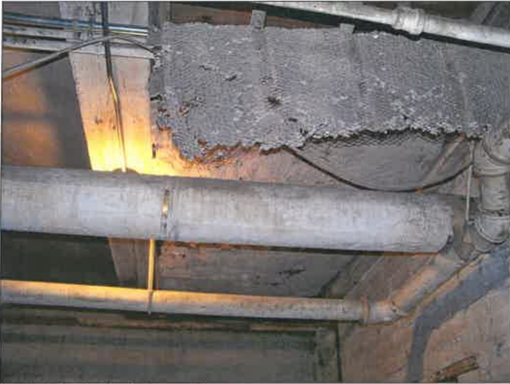
Interior – deterioration of plaster ceiling