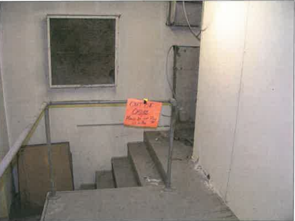
Interior – narrow accessibility between wall, stair railing; non-functioning building system (plumbing in restroom)