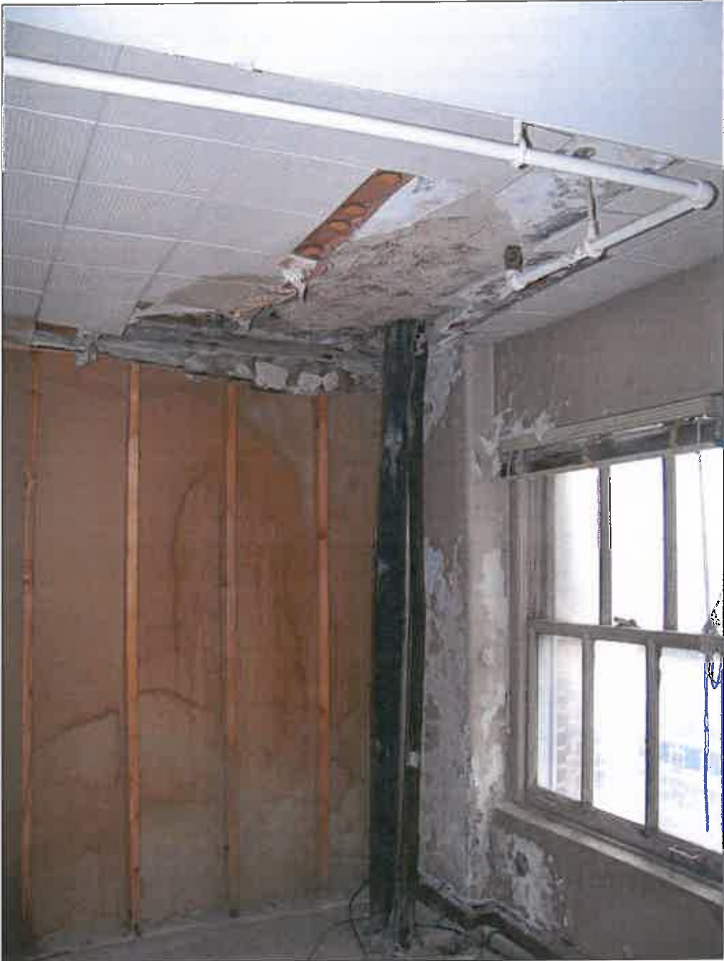
Interior – evidence of water intrusion; failure of finishes, ceiling