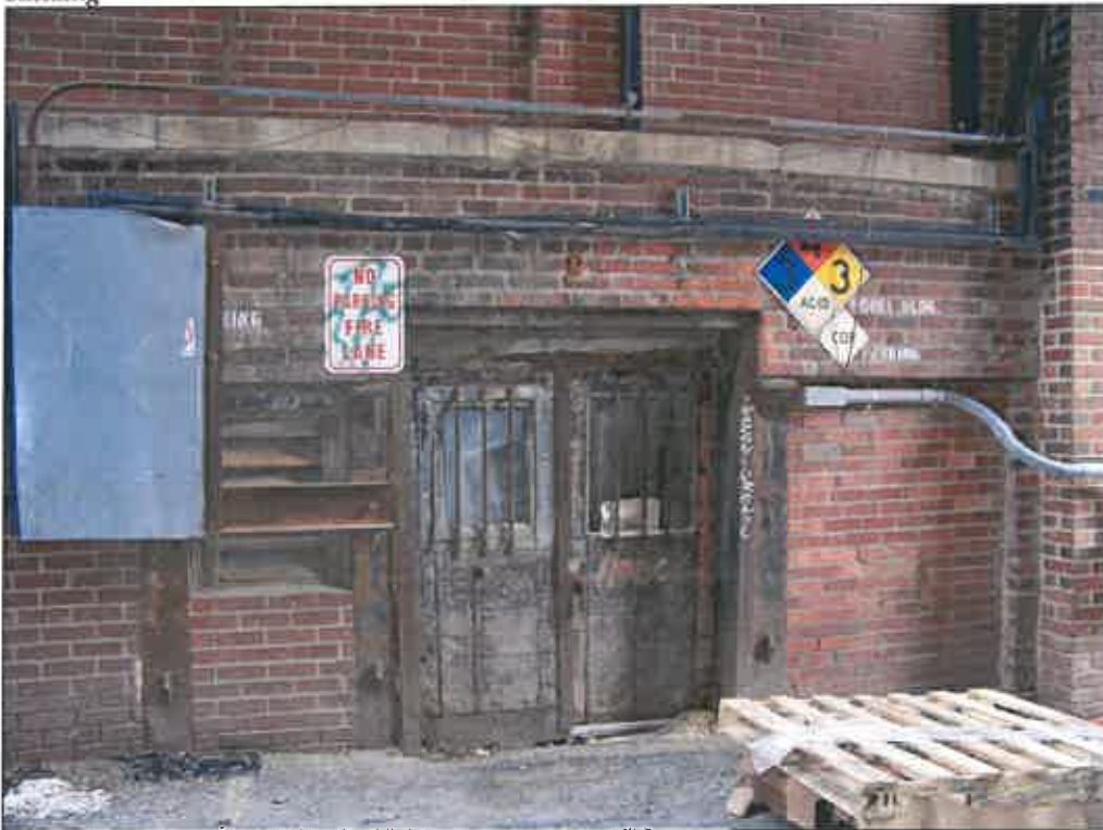
Loading area in alley on west side of Study Area – graffiti