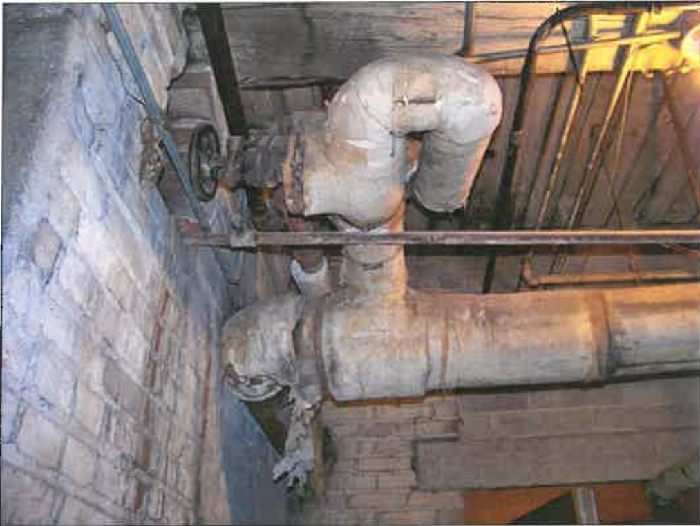
Interior – asbestos pipe insulation