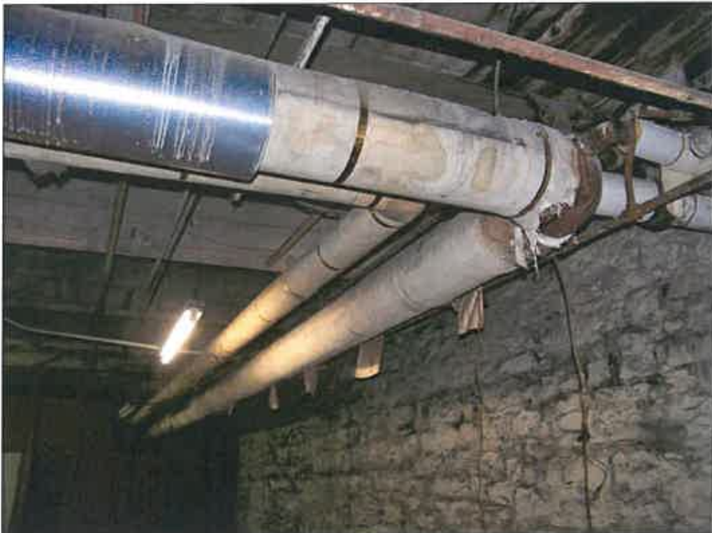
Interior – asbestos pipe insulation