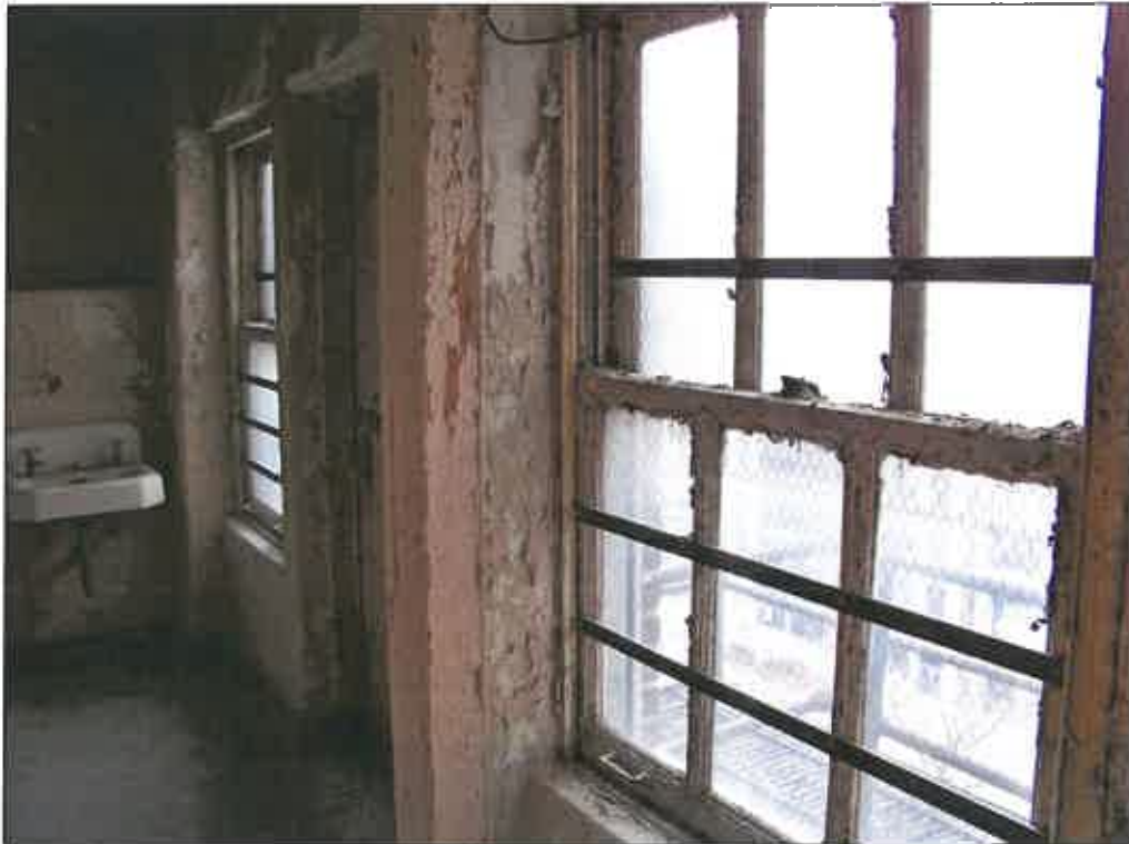
Interior – failure of finishes