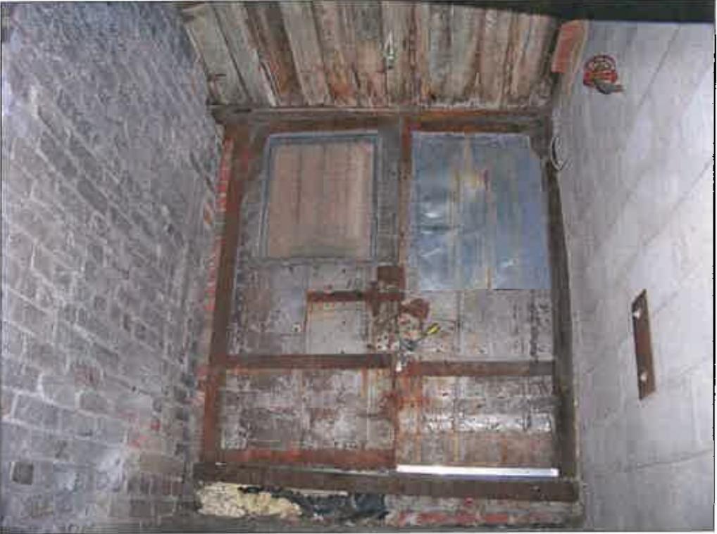
Interior – deterioration of door, unsecure (held closed with screwdriver)