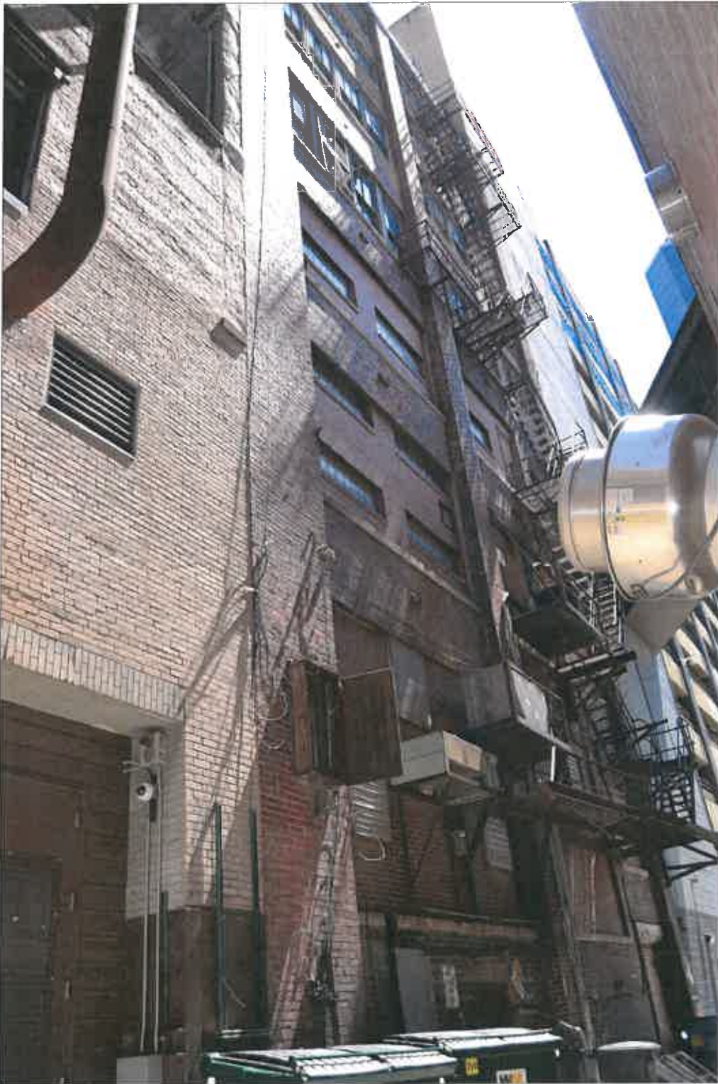
1108-1110 Grand Boulevard – West Elevation (back of building facing north/south alley)