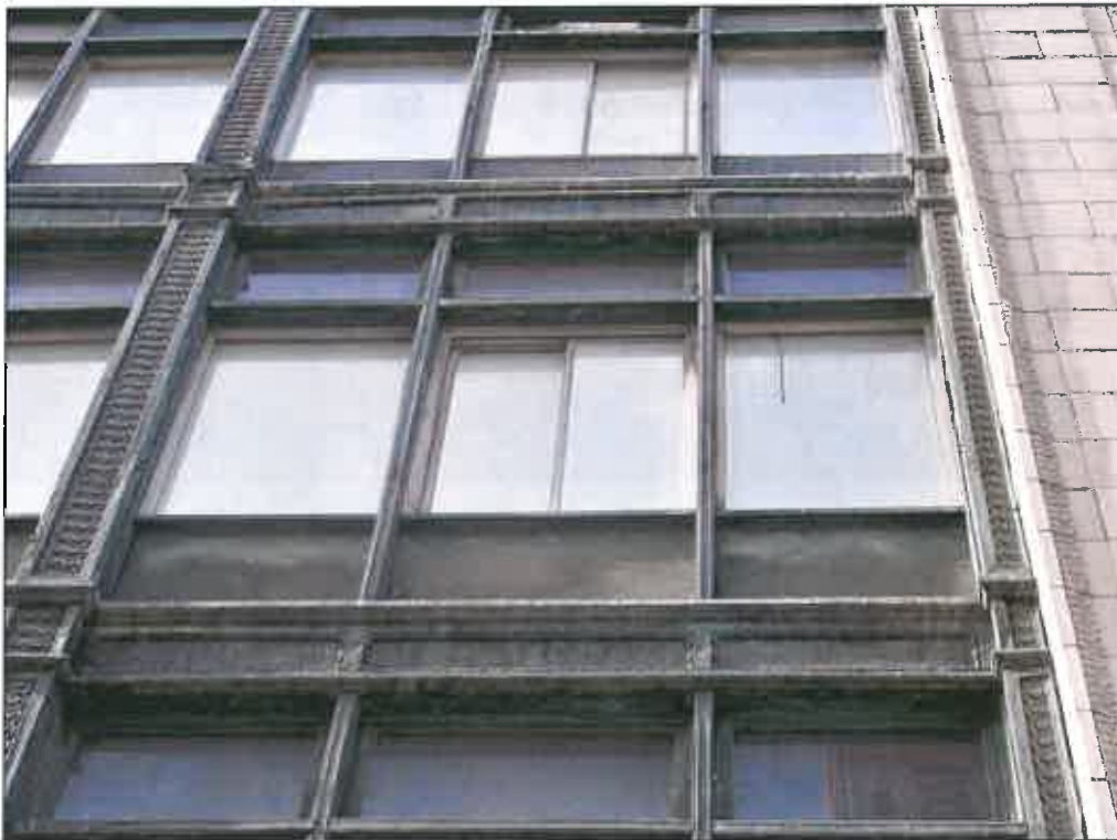
Front façade – deterioration of windows; copper curtain wall requires restoration