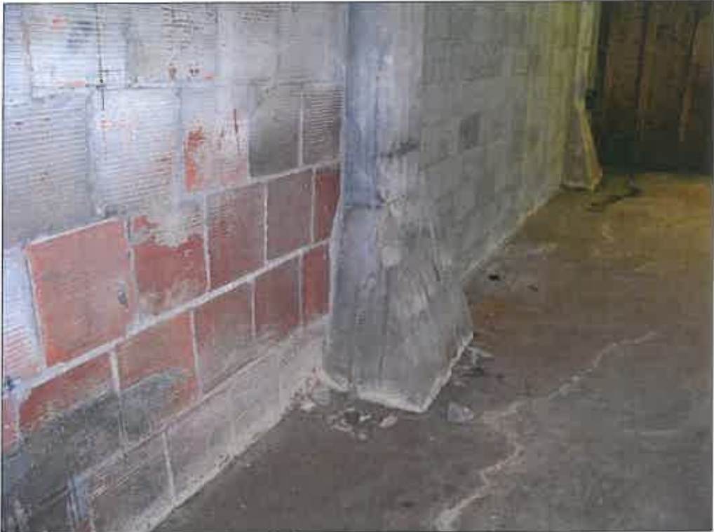
Interior – stress fracture at column footing