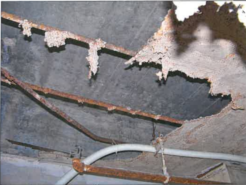
Interior – deterioration of plaster ceiling