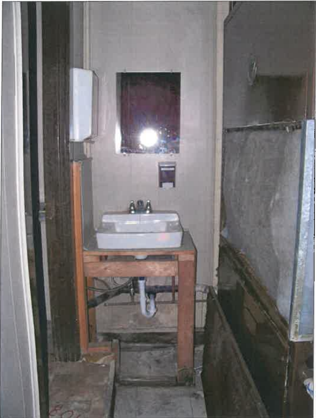
Interior – restroom with poor accessibility, improper clearances