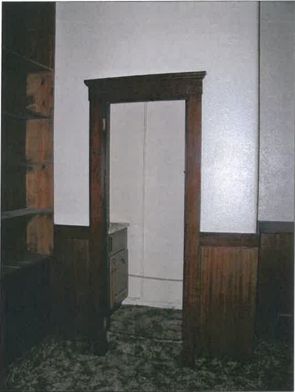
Interior – restroom with poor accessibility, improper clearances