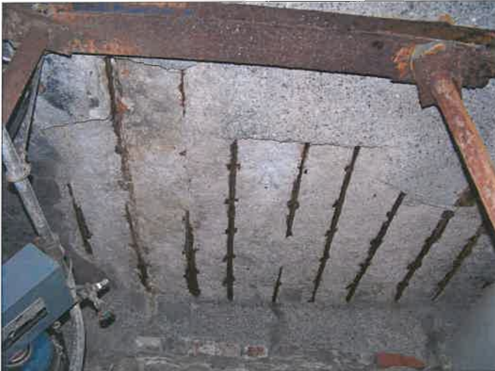
Interior – exposed, corroded steel, underneath side of sidewalk; support required to prevent sidewalk failure

Examples of this condition are shown below and on the following pages. The Study Area clearly exhibits insanitary or unsafe conditions and to an extent that endangers property and life.