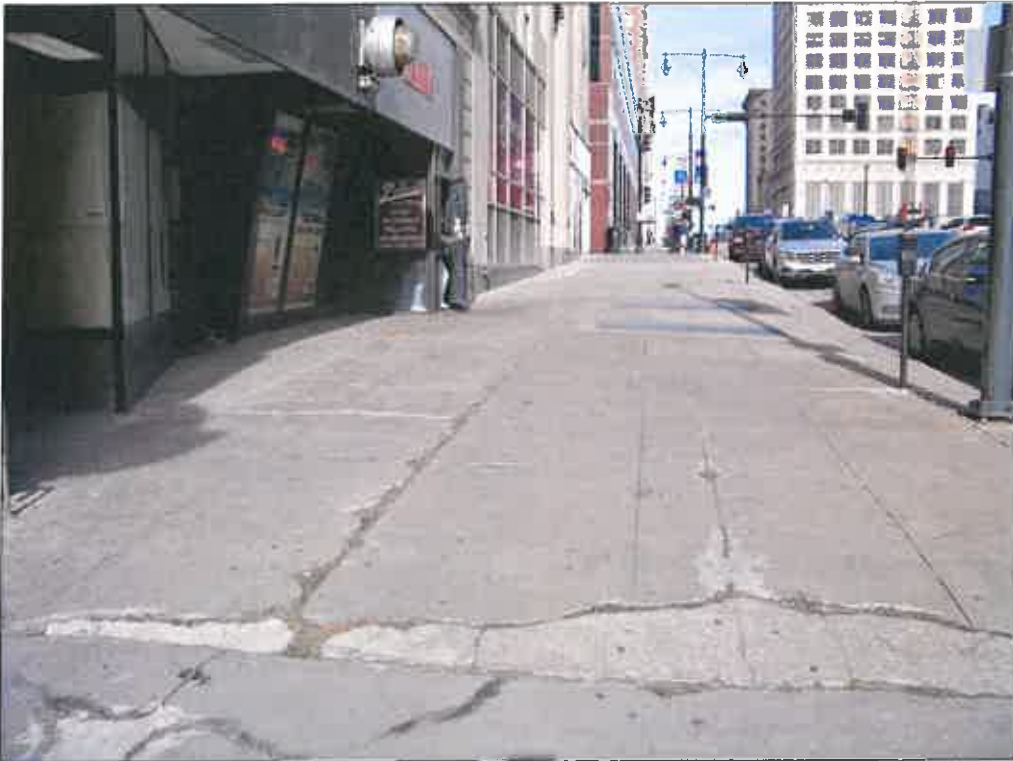
Looking north in front of Study Area – uneven, deteriorating sidewalk; pigeon excrement in front of entrances, building