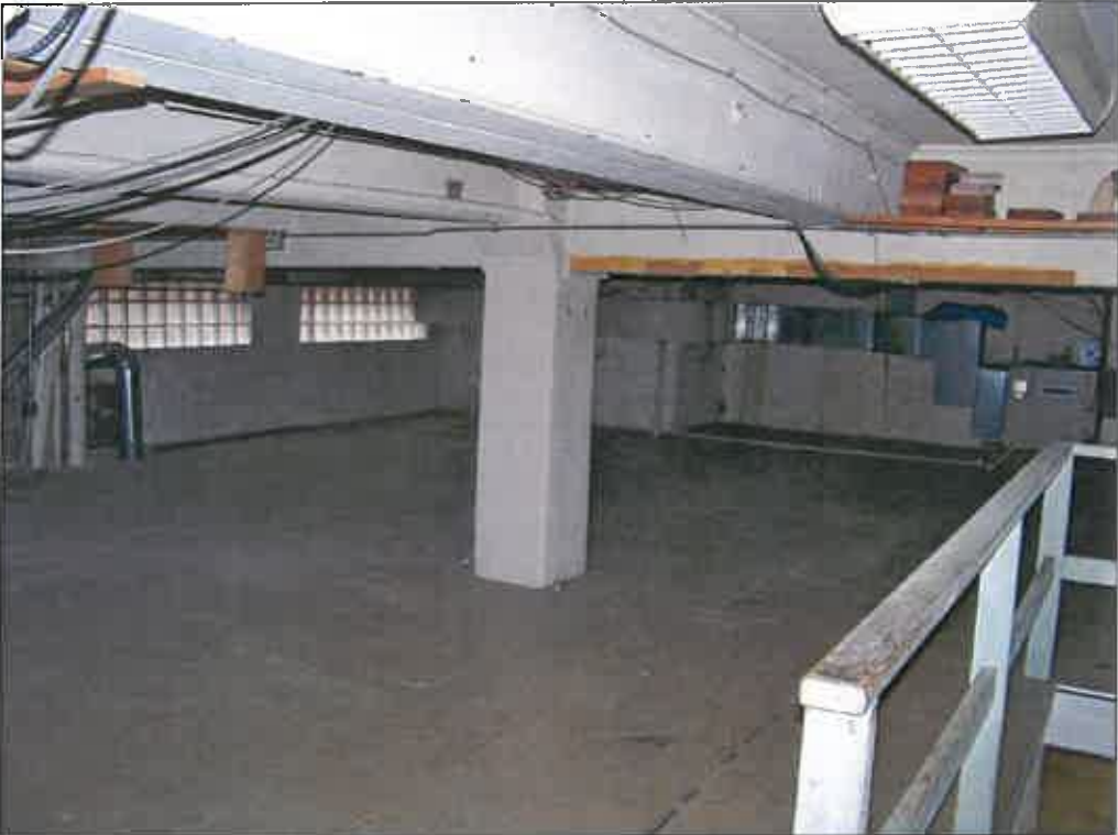
Interior – mezzanine level – low ceiling height, suitable only for storage; lead-based paint