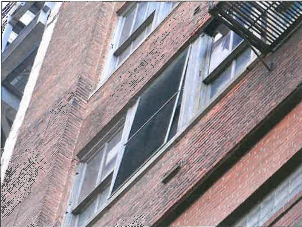
Rear façade – deterioration of windows, lintels; brick masonry requires pointing