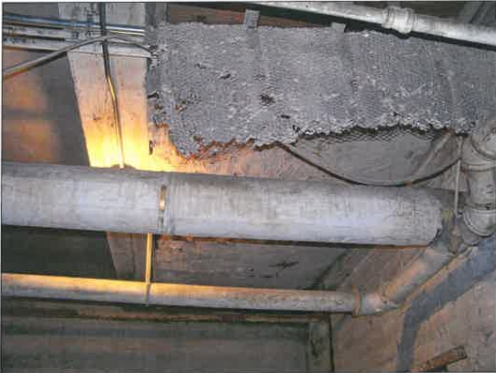
Interior – asbestos pipe insulation