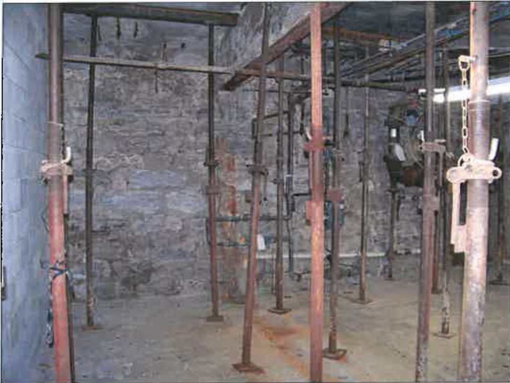
Interior – corroded, deteriorated supports in basement vault supporting sidewalk above