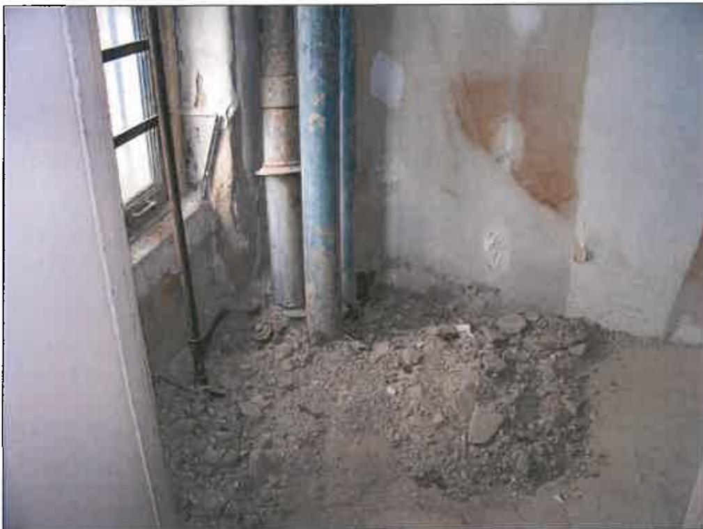
Interior – failure of finishes; debris