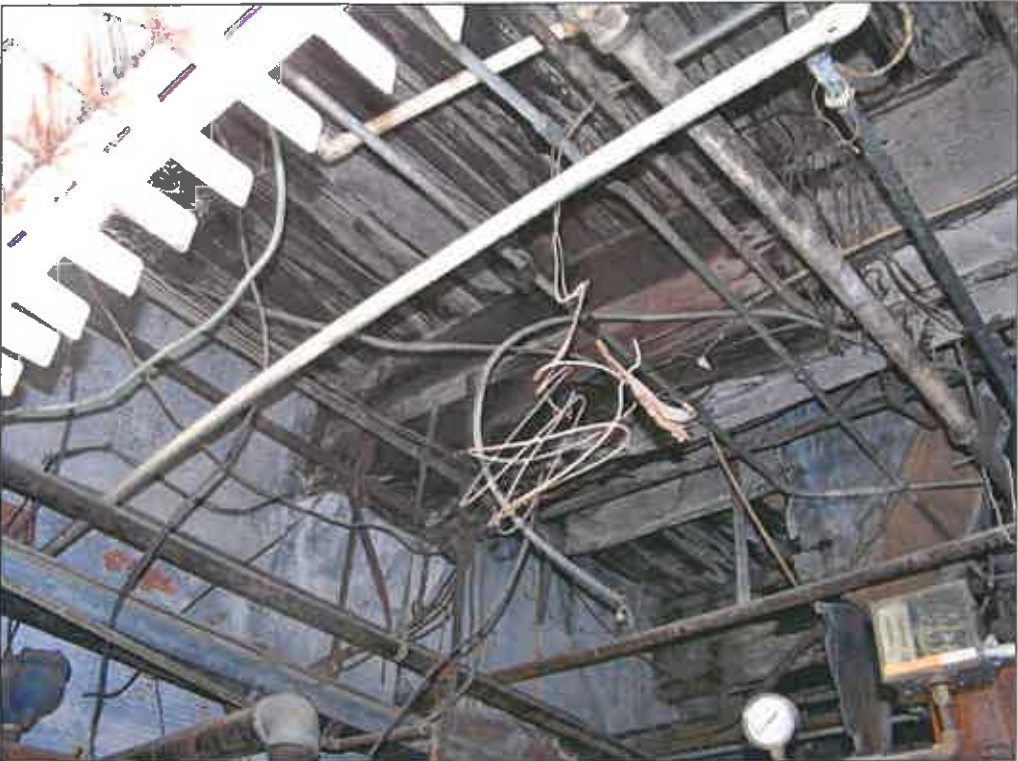
Interior – exposed wiring, evident fire damage