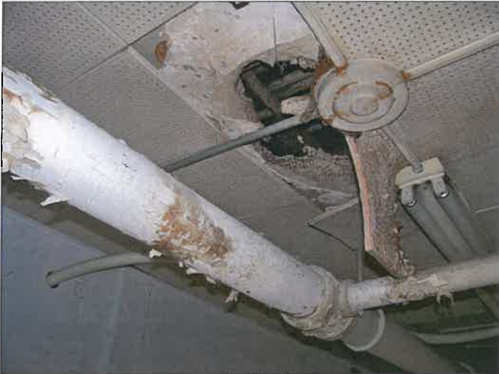
Interior – evidence of water intrusion, deterioration of ceiling