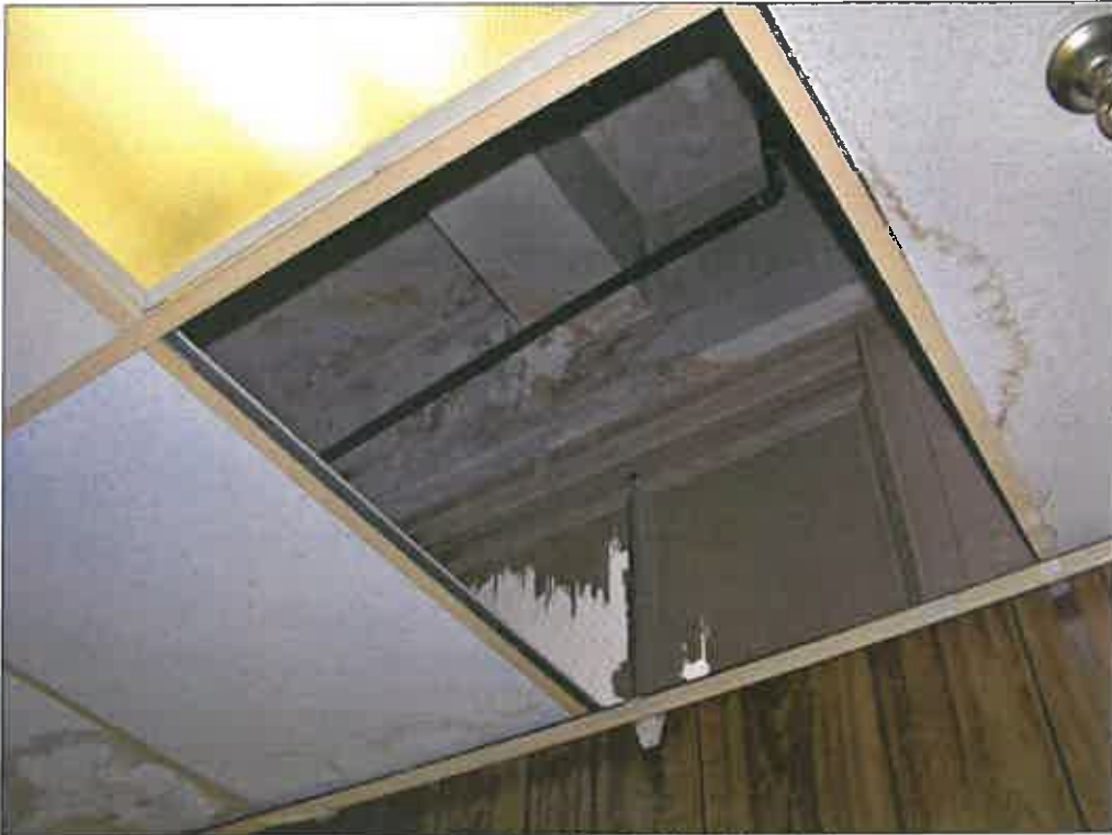
Interior – evidence of water intrusion; deterioration of ceiling tile, window