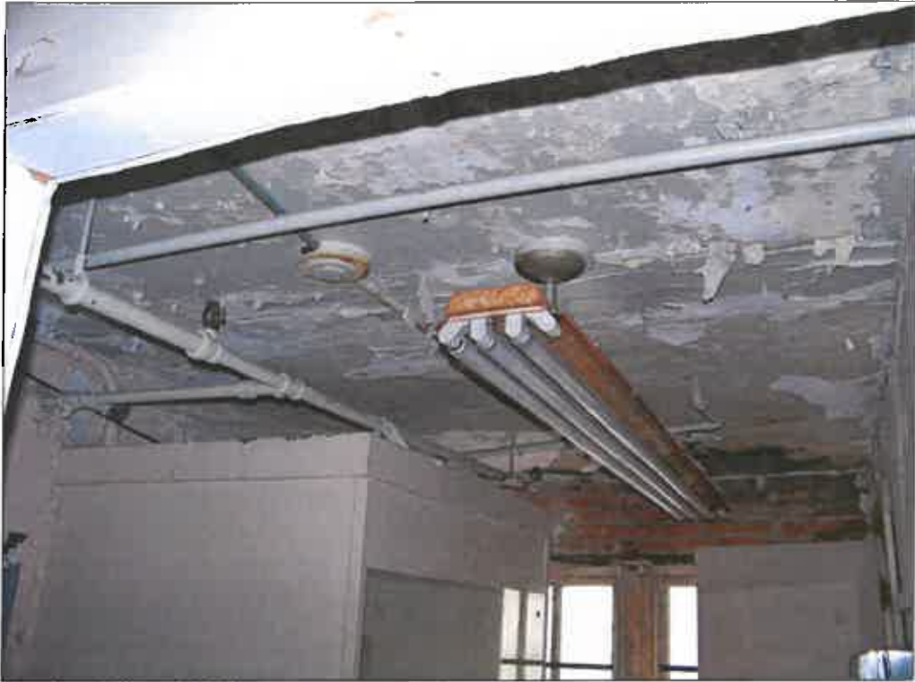
Interior – failure of finishes