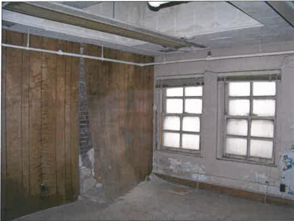
Interior – evidence of water intrusion; failure of finishes