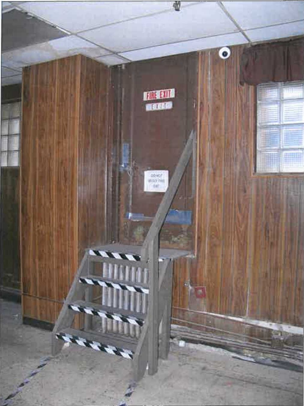
Interior – improper access to fire exit, lack of emergency lighting