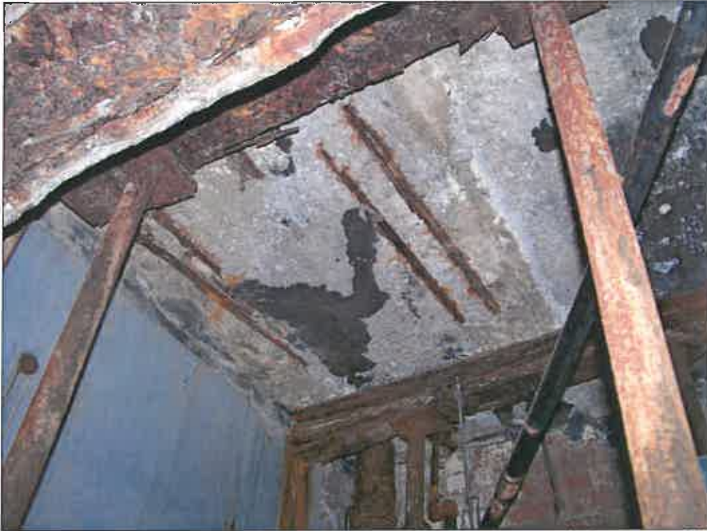
Interior – exposed, corroded steel, underneath side of sidewalk; support required to prevent sidewalk failure