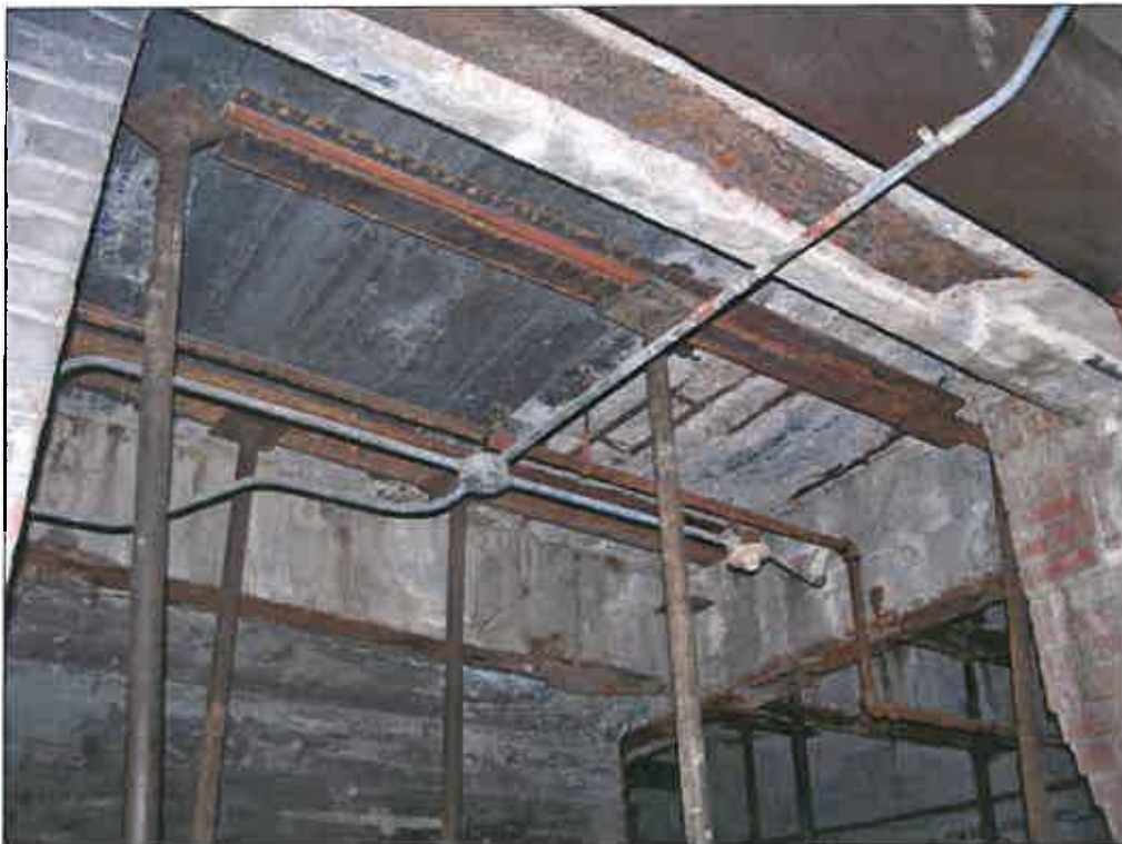
Interior – deterioration of steel and concrete structural components, supports