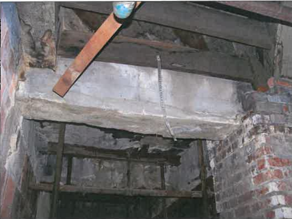
Interior – deterioration of heavy mill lumber beams, brick piers