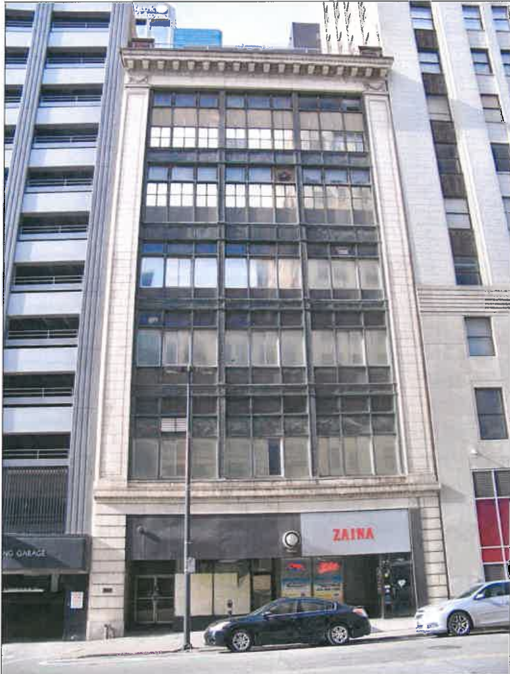
1108-1110 Grand Boulevard – East Elevation (front of building facing Grand Boulevard)

The front façade is capped with a projecting terra cotta dentil cornice. The copper curtain wall consists of a gridded system of columns, beams, and ribbons of windows.