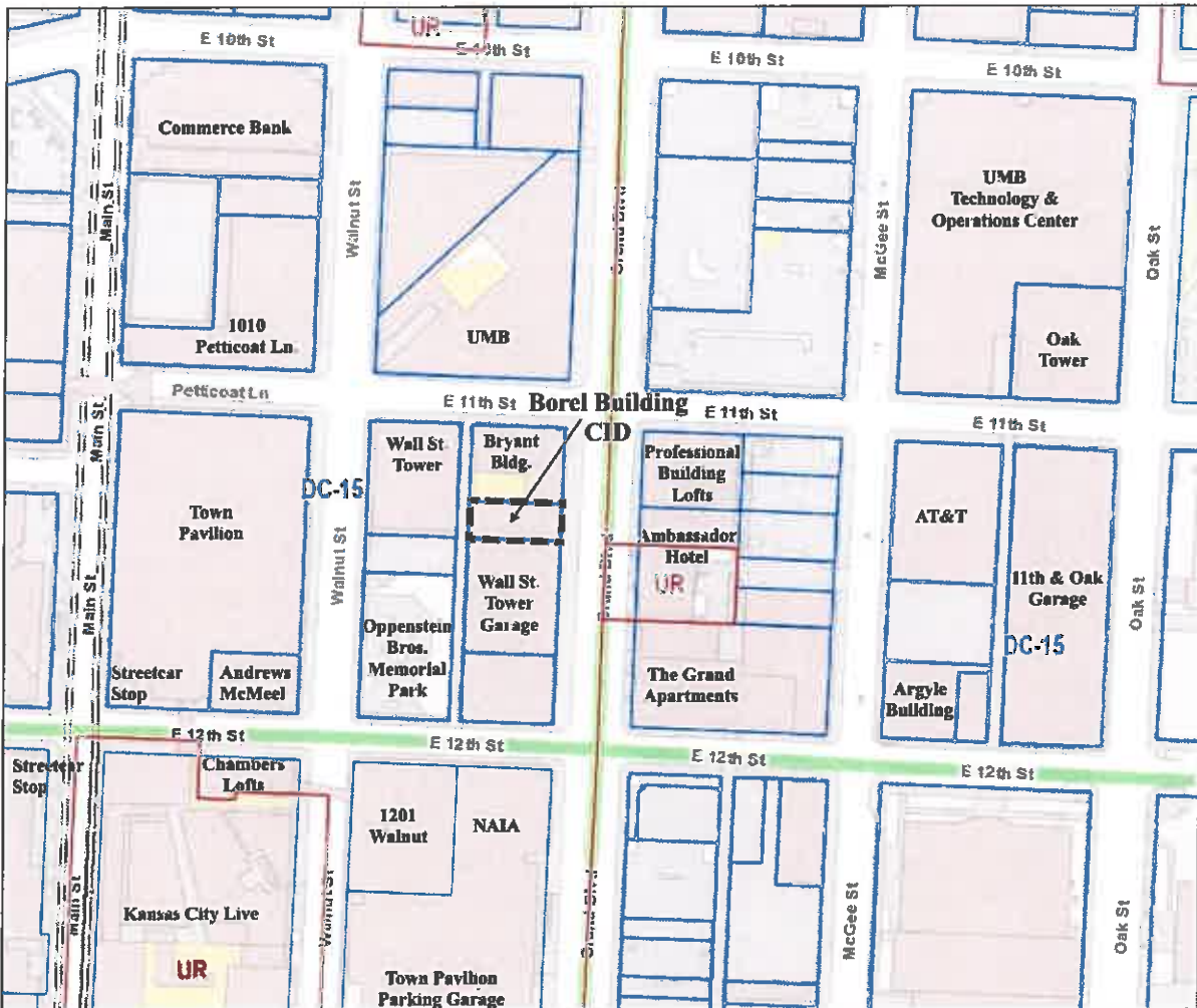
Borel Building Community Improvement District – Zoning Map

The existing zoning in the Study Area is DC-15 (Downtown Core – 15). The DC, Downtown Core district is primarily intended to promote high-intensity office and employment growth within the downtown core. The DC district regulations recognize and support downtown's role as a center of regional importance and as a primary hub for business, communications, office, government, retail, cultural, educational, visitor accommodations, and entertainment. The district regulations are primarily intended to accommodate a broad mix of office, commercial, public, recreation, and entertainment uses. The DC district also accommodates residential development, both in a stand-alone high-density form and mixed with office and retail uses.