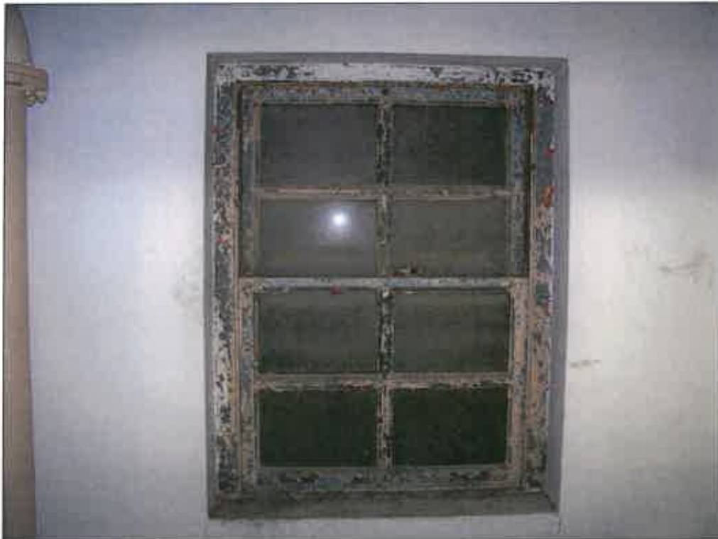
Interior – deterioration of window, failure of finishes