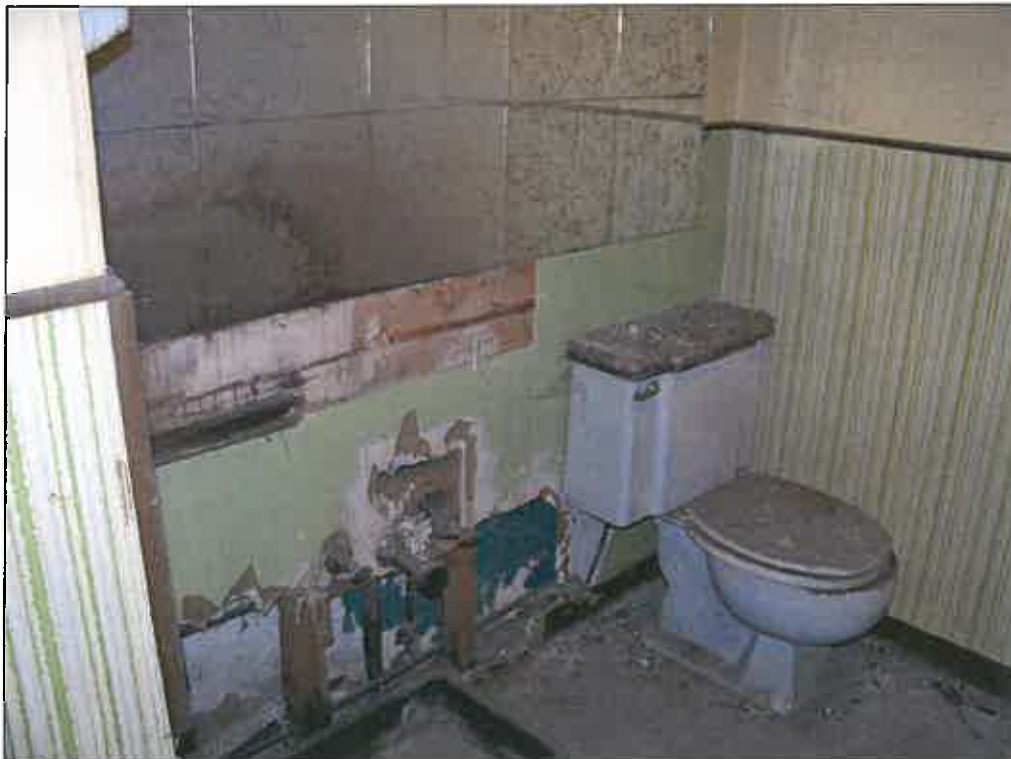
Interior – failure of finishes; nonfunctioning fixtures