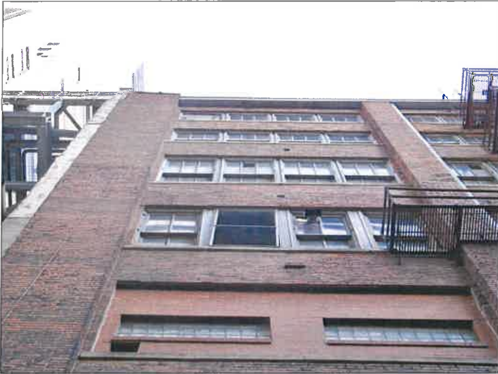
Rear façade – deterioration of lintels; brick masonry requires pointing