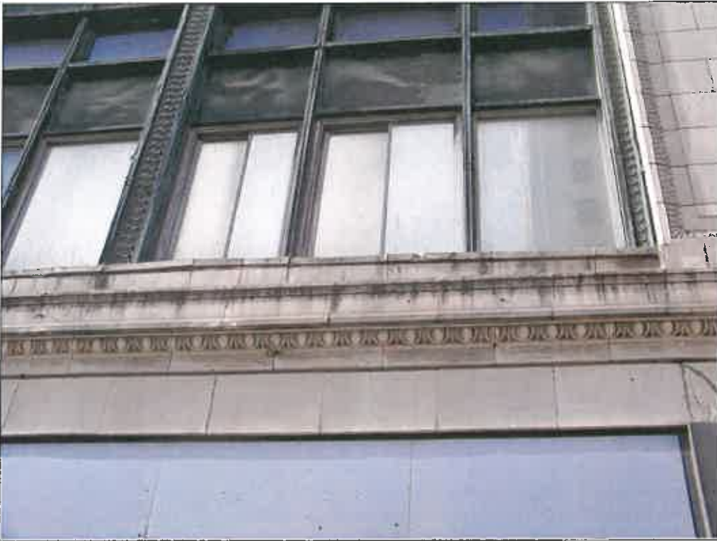
Front façade – deterioration of mortar resulting in loose terra cotta; copper curtain wall requires restoration