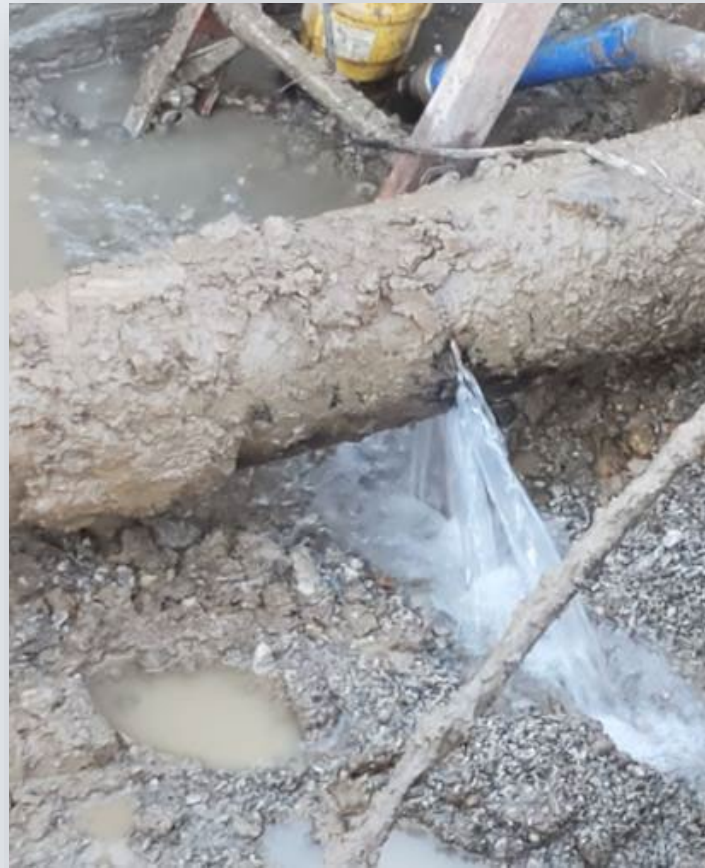
Broken water main leaking