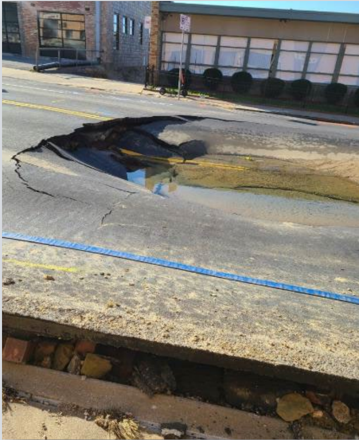
Street collapse due to a water main break