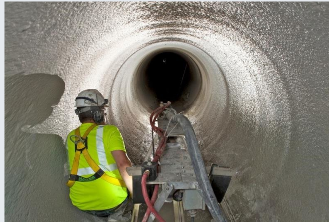
Application of Sewer Spray Liner