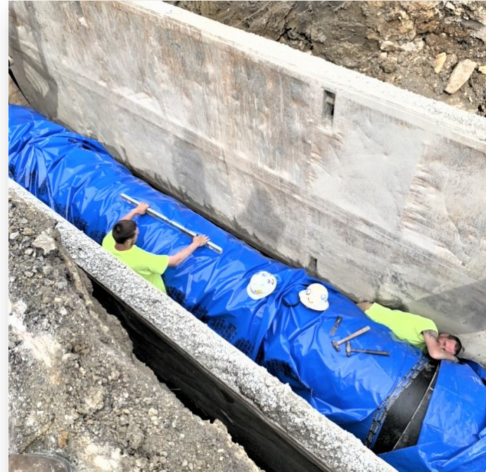
Crew checking the water line slope and securing polywrap around a water main.