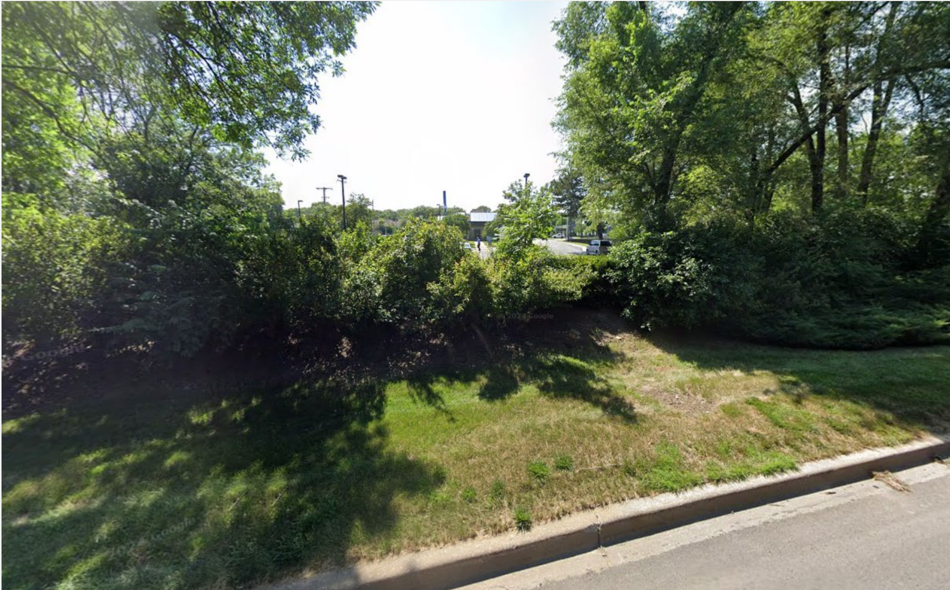
View from site from Ward Pkwy. (June 2022)