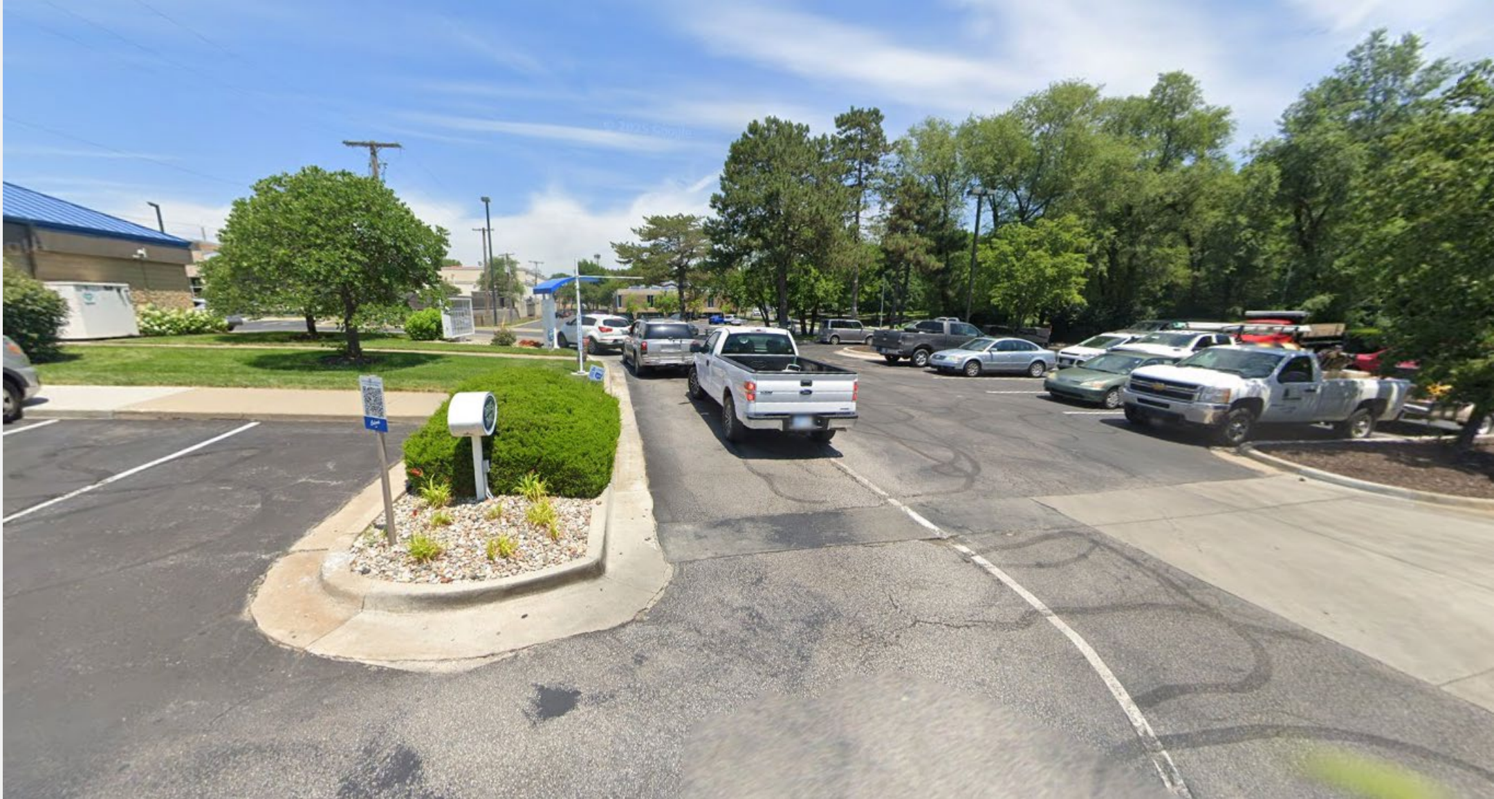
Existing drive-through layout. (June 2022)