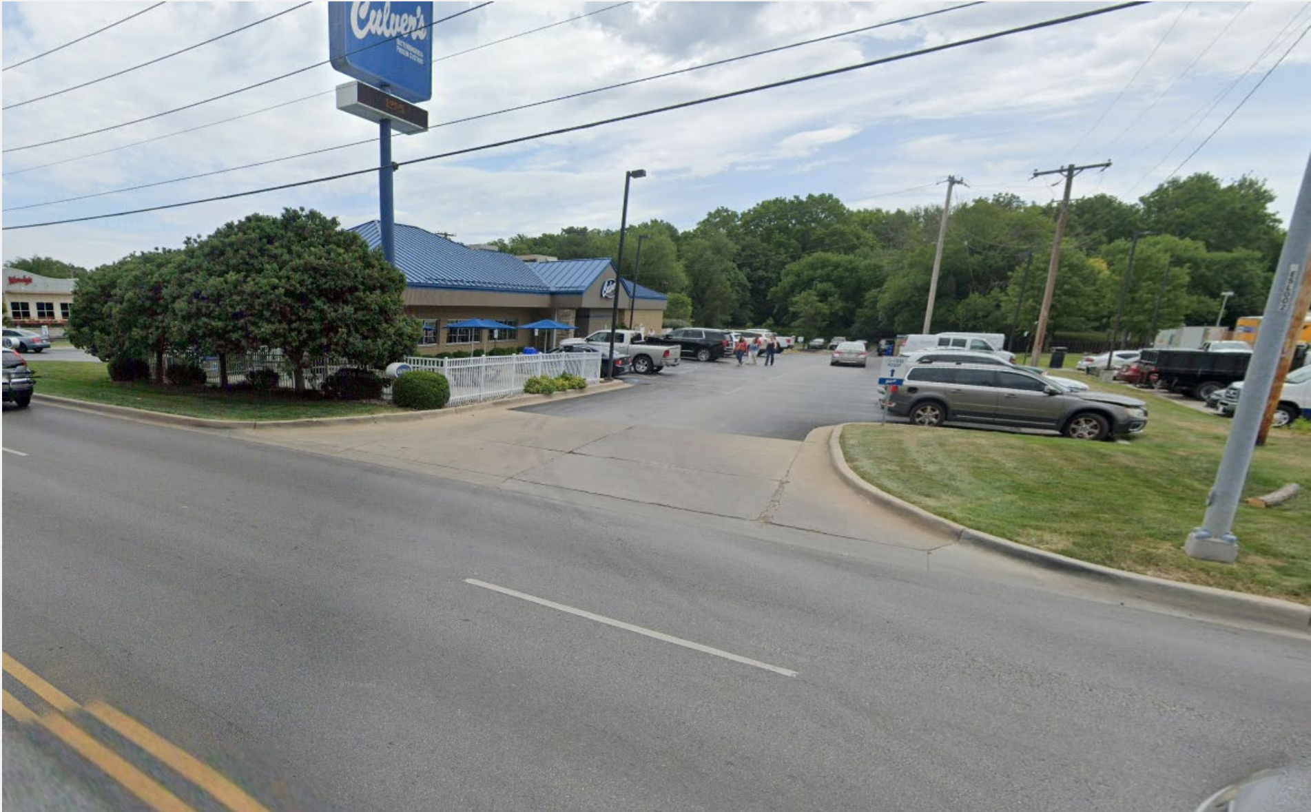
View towards site (entrance) from State Line Rd. (June 2024)