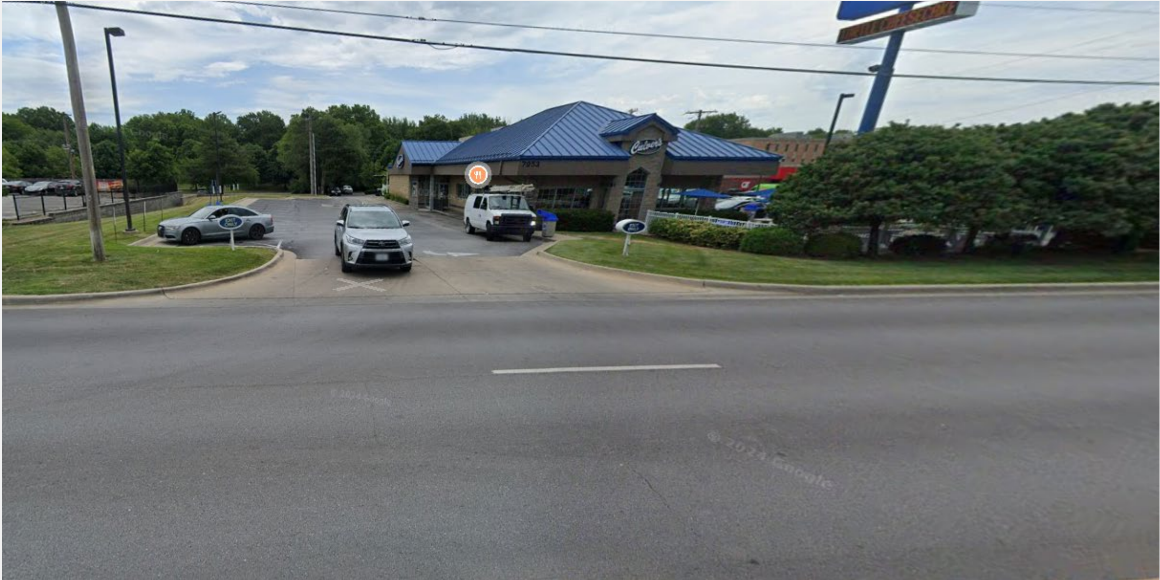
View towards site (exit) from State Line Rd. (June 2024)