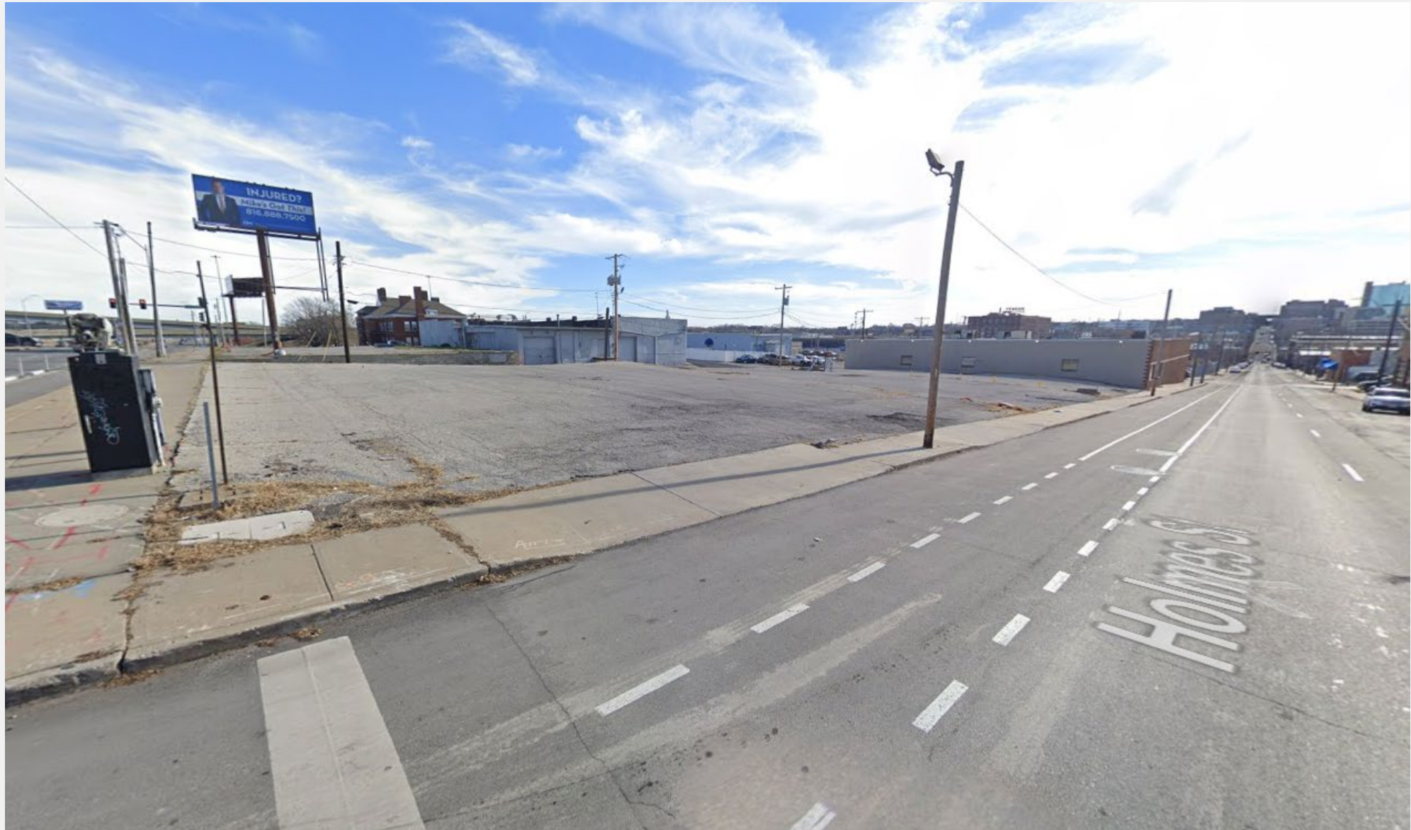
View towards site going south on Holmes St (Dec 2023)