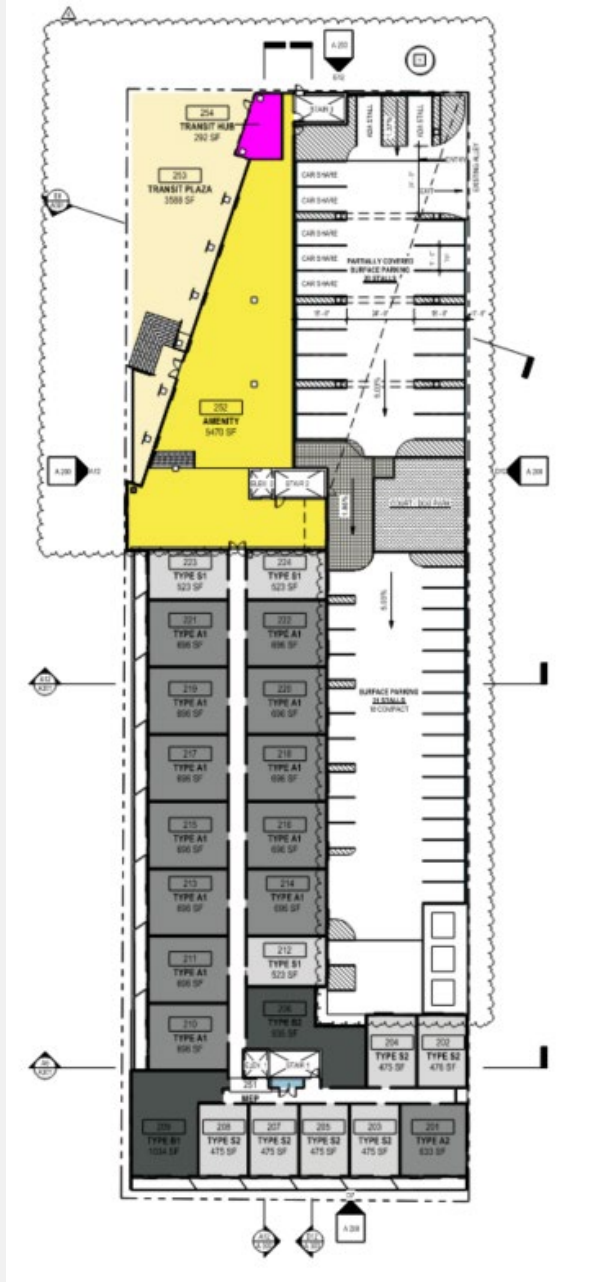
2 nd Story Floor Plan (at-grade on north)