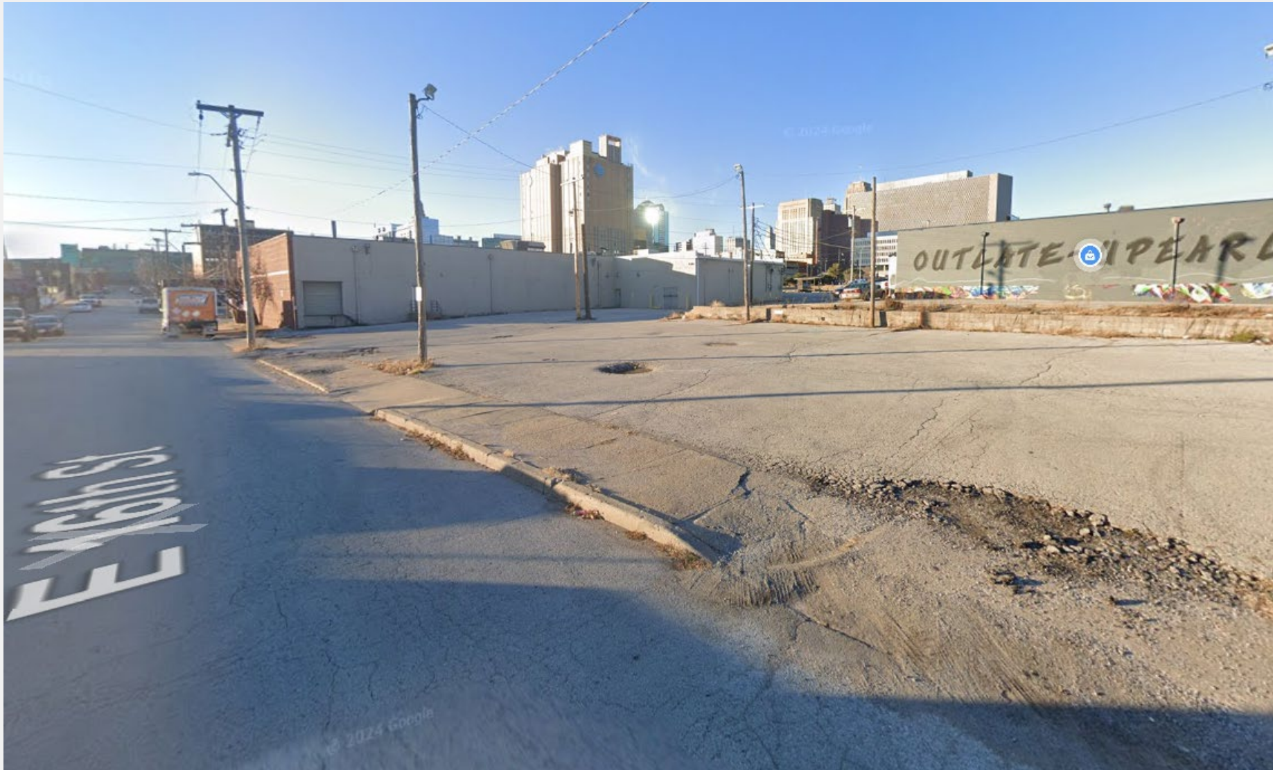
View from 16 th St & Charlotte St towards site. City-owned parking lot to be used and existing alley to access parking garage.