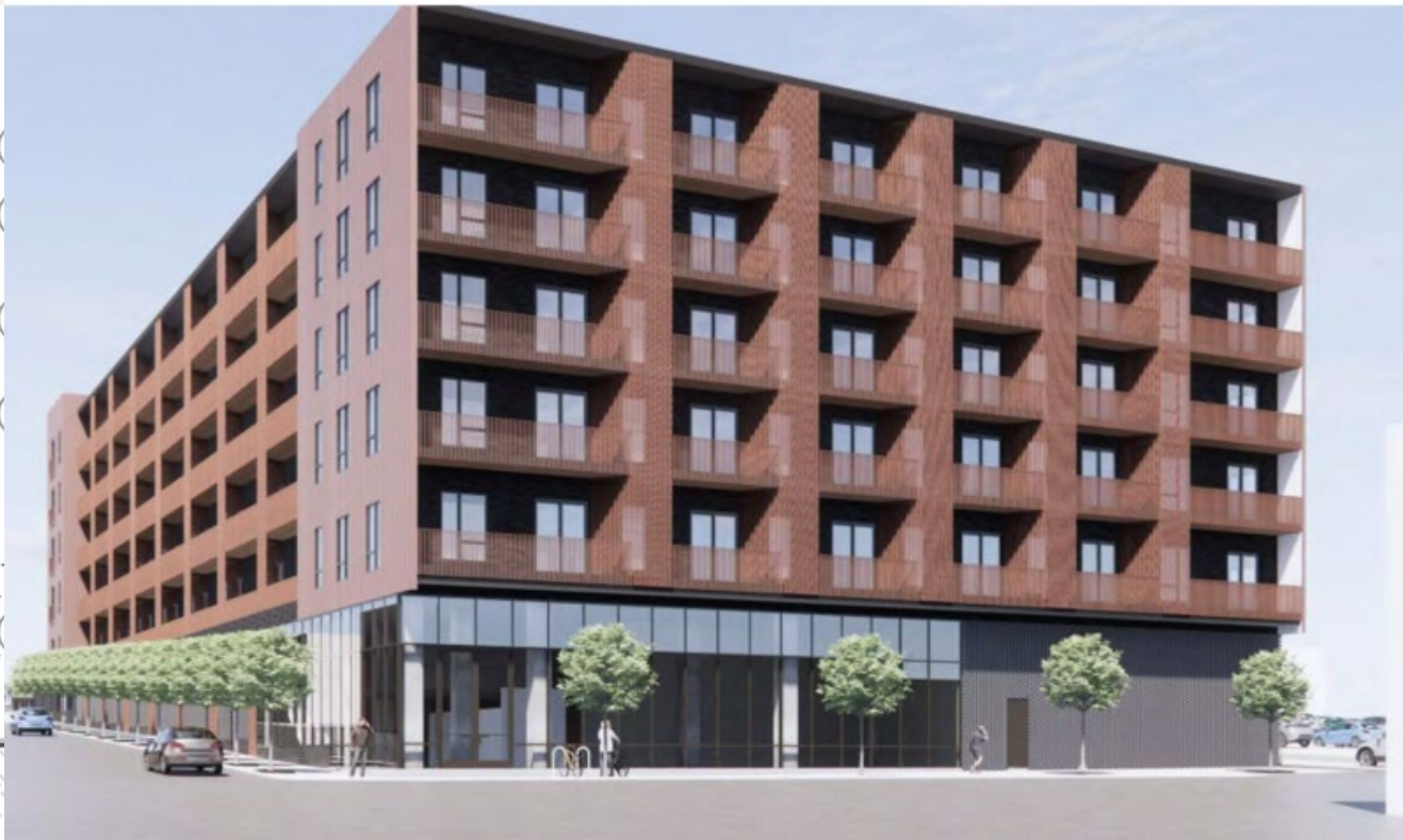
South Elevation (16 th St)