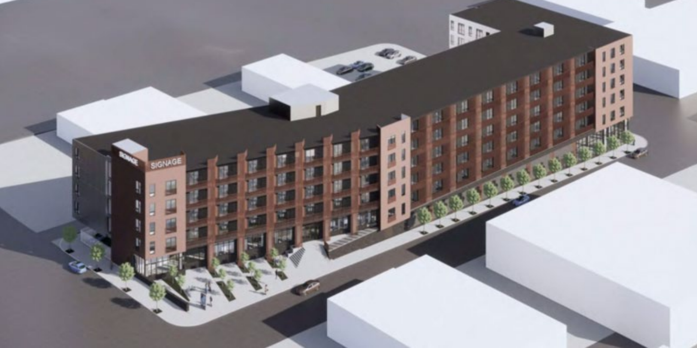
West Elevation – front (Holmes St)