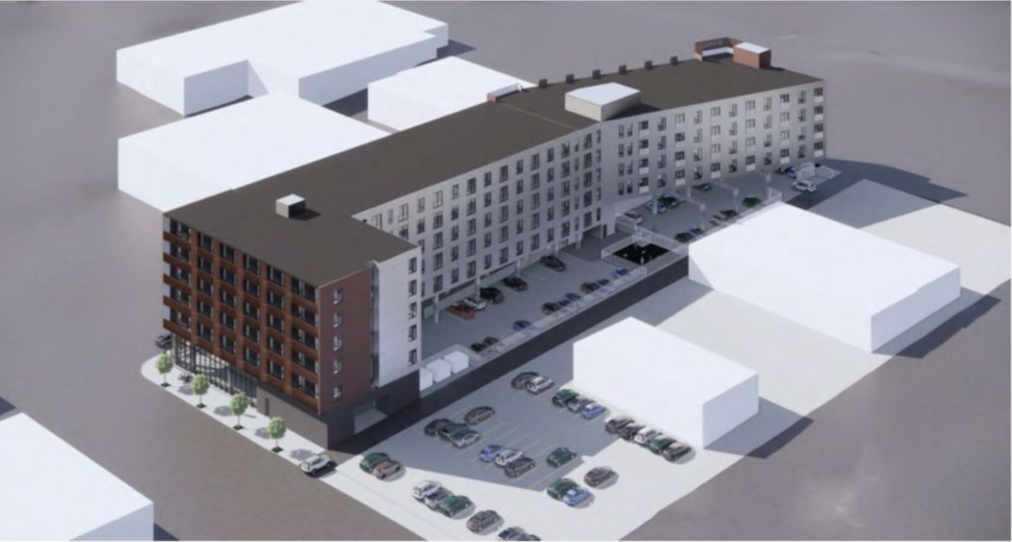
East & South Elevation – (16 th St and Alley)