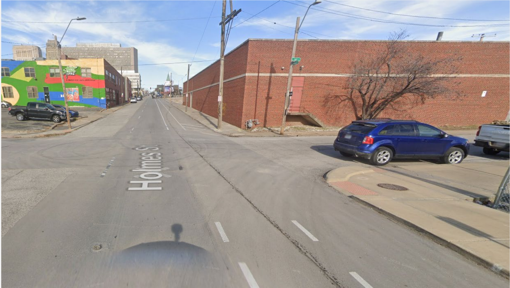
View north on Holmes St. Subject site on right (Dec 2023)