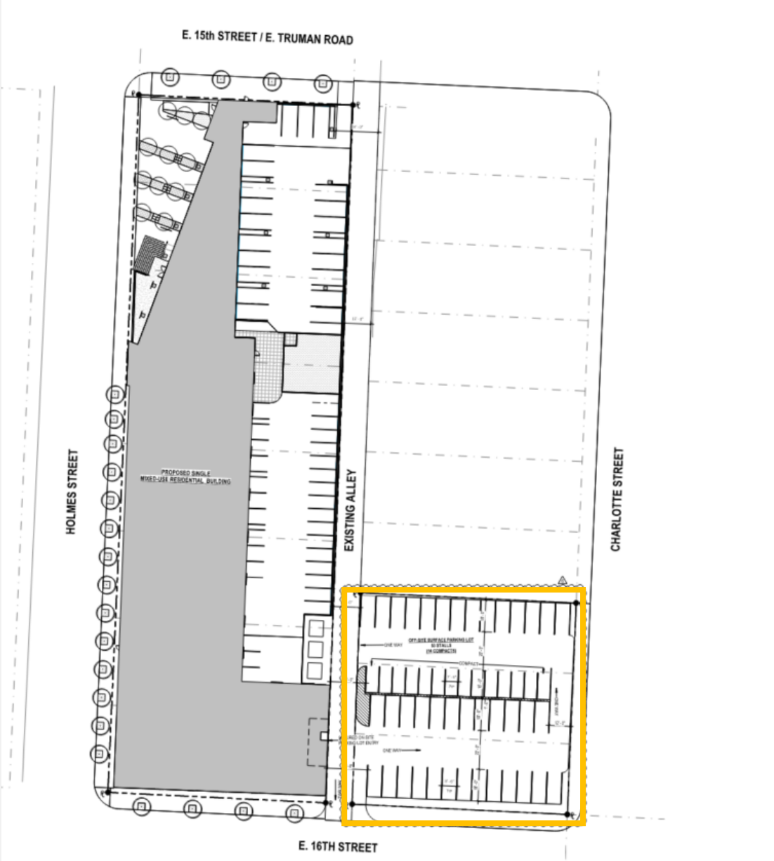
Additional Parking (City-Owned Property)