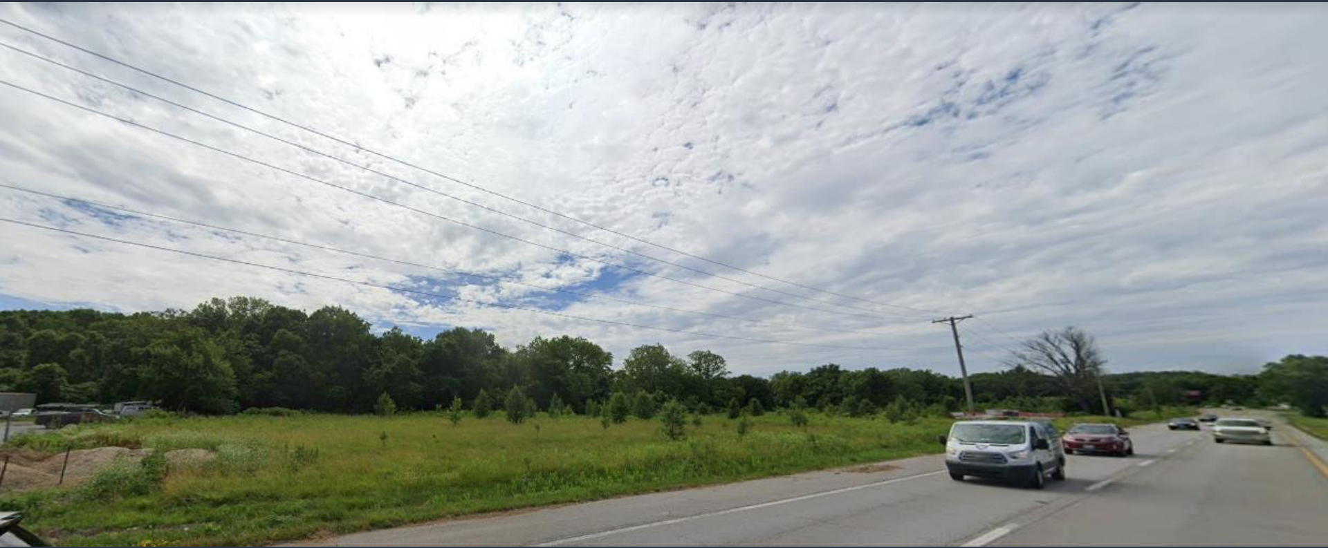
View looking southwest on Blue Parkway