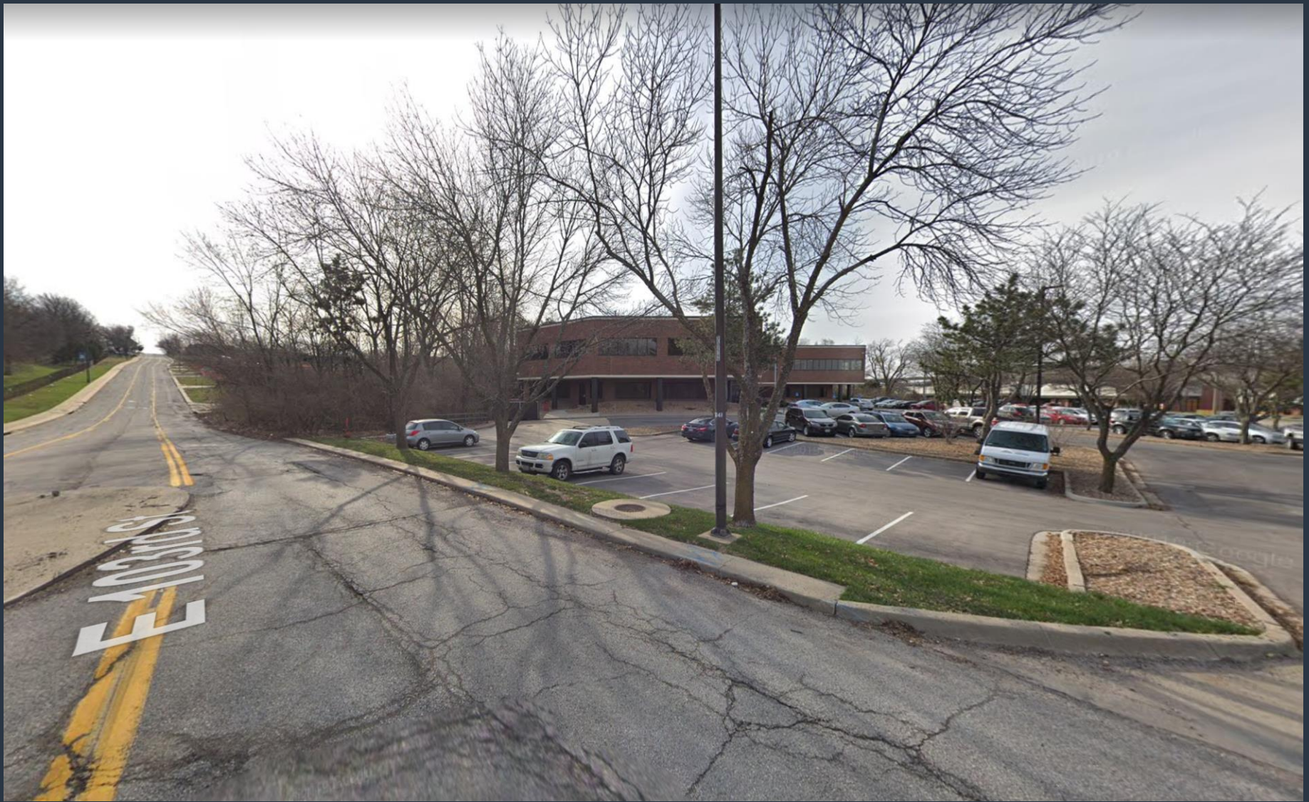
View looking southeast towards the site from E 103 rd St