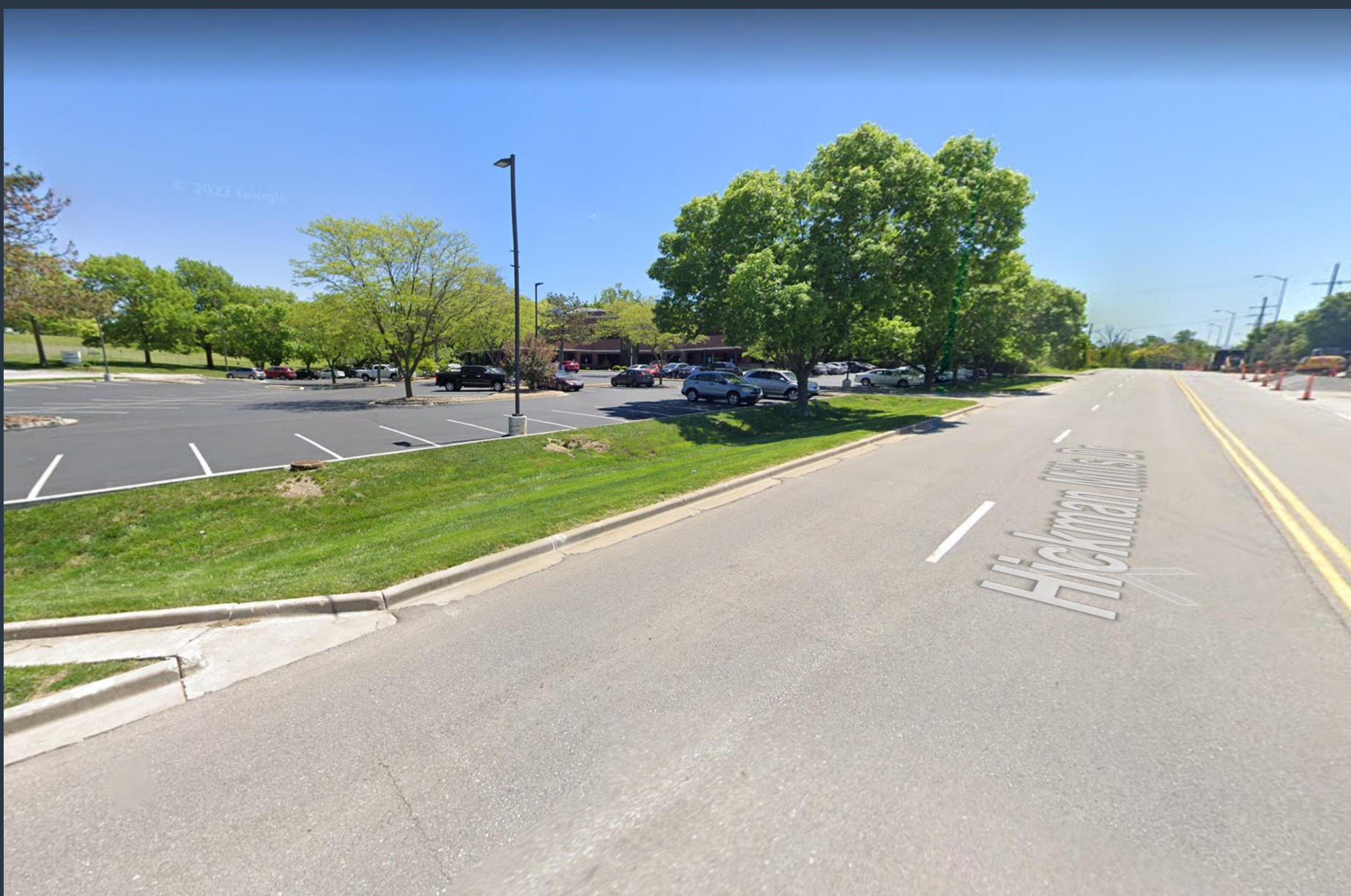
View looking northeast towards the site from Hickman Mills Dr