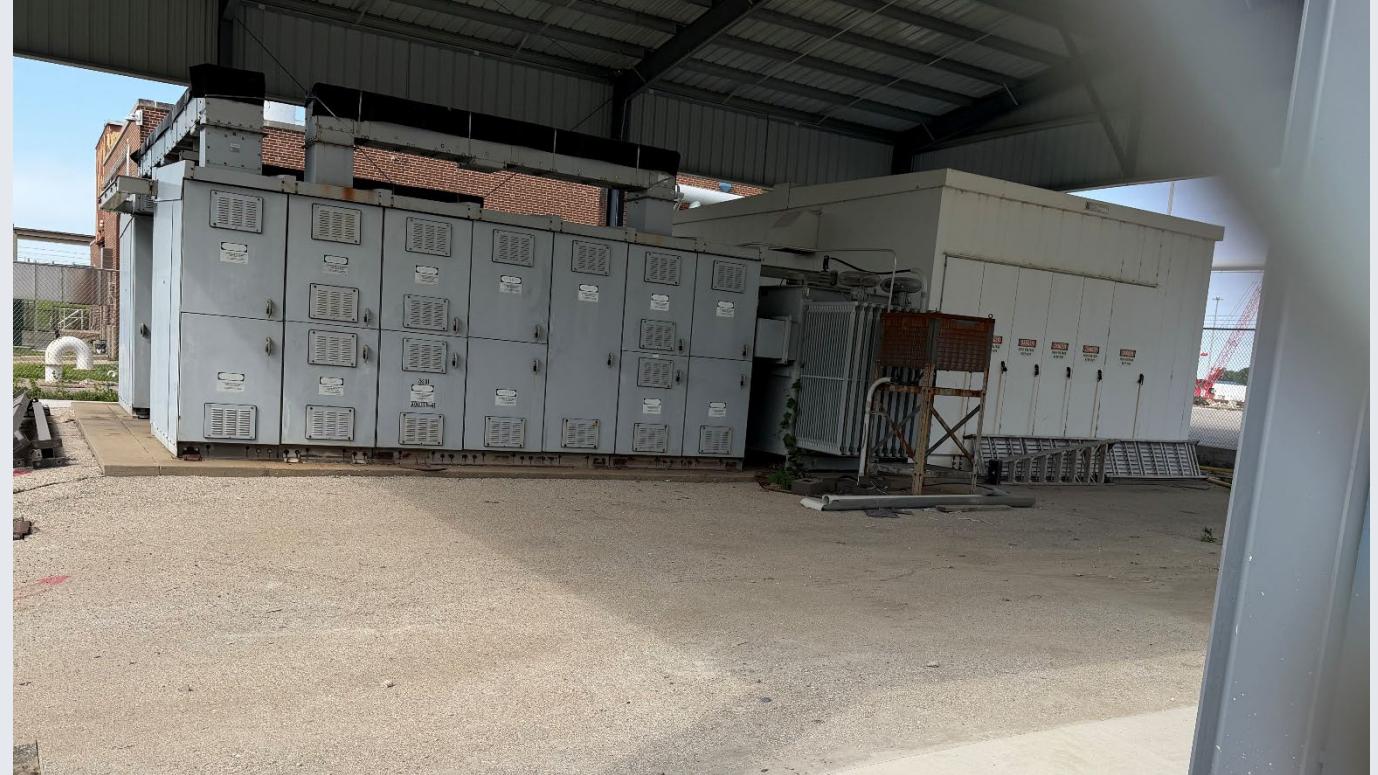
Blue River Wastewater Treatment Plant Power Pen