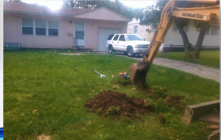
Automated Metering Equipment and Installation