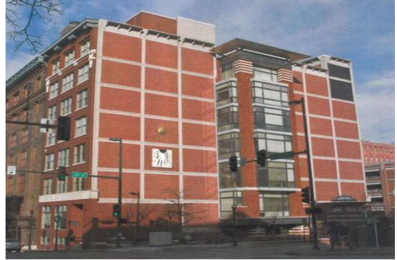
Poindexter/Gatlin Building 801 Broadway – Project Area M