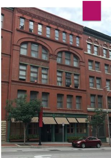
Thayer Building – 816 Broadway – Project Area F