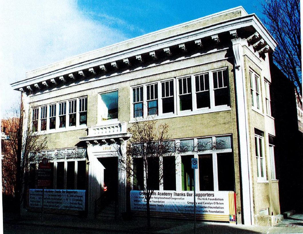
CROSSROADS ACADEMY 1015 Central – Project Area M