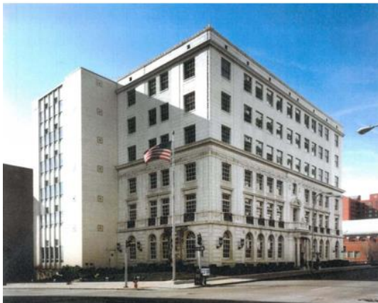
Deramus Building 301 West 11 th Street – Project Area E